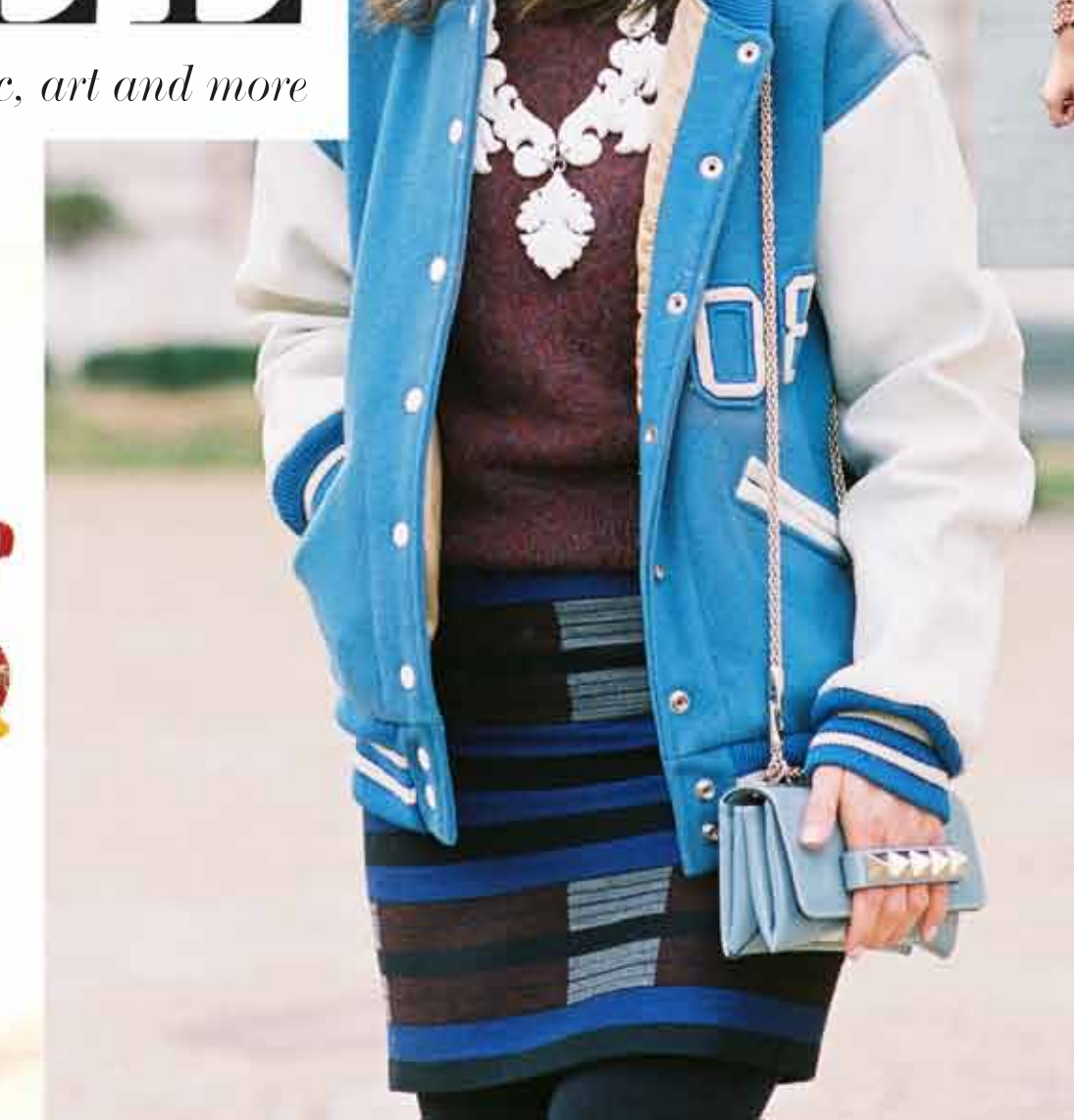
GET THE LOOK