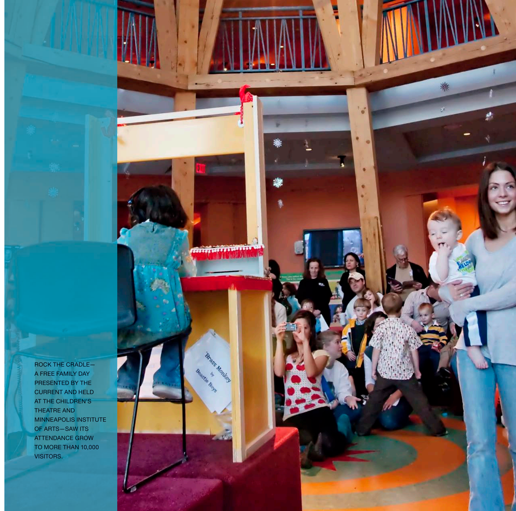
ROCK THE CRADLE— A FREE FAMILY DAY PRESENTED BY THE CURRENT AND HELD AT THE CHILDREN'S THEATRE AND MINNEAPOLIS INSTITUTE OF ARTS—SAW ITS ATTENDANCE GROW TO MORE THAN 10,000 VISITORS.