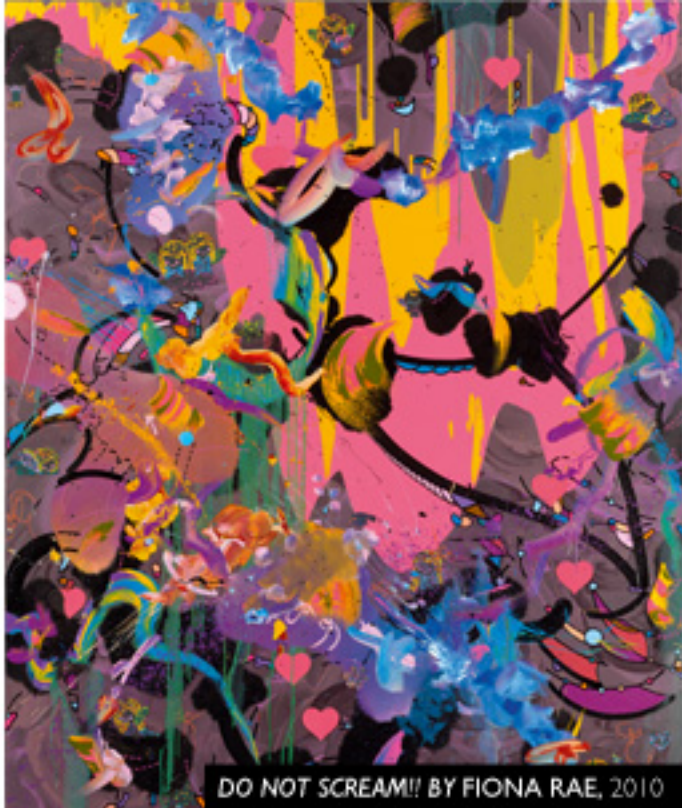
DO NOT SCREAM!! BY FIONA RAE, 2010