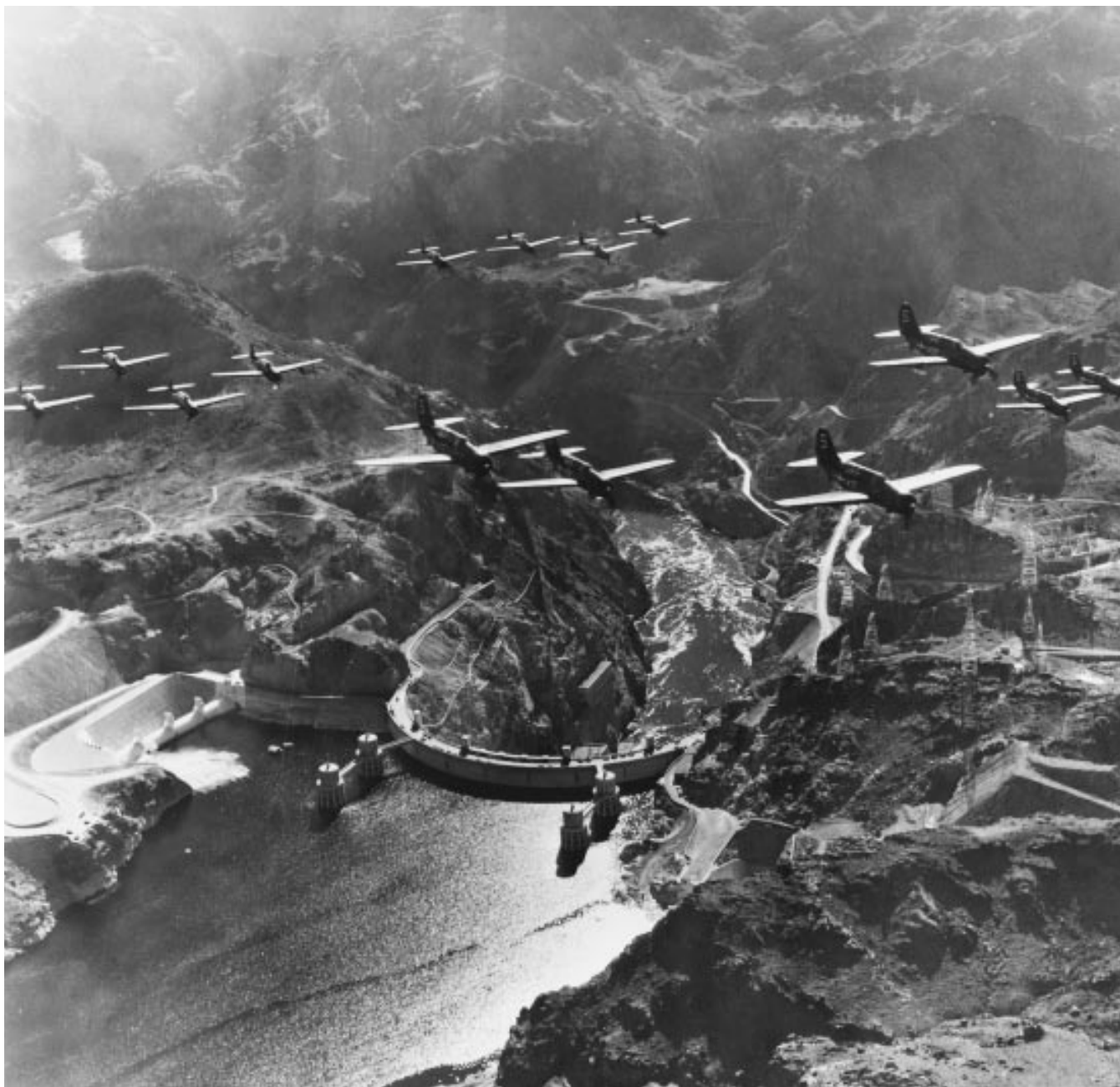
Squadron SB2C-5 Helldivers fly over Boulder Dam in 1948.

‡ CVG-5 aircraft were assigned the tailcode S on 12 December 1946.