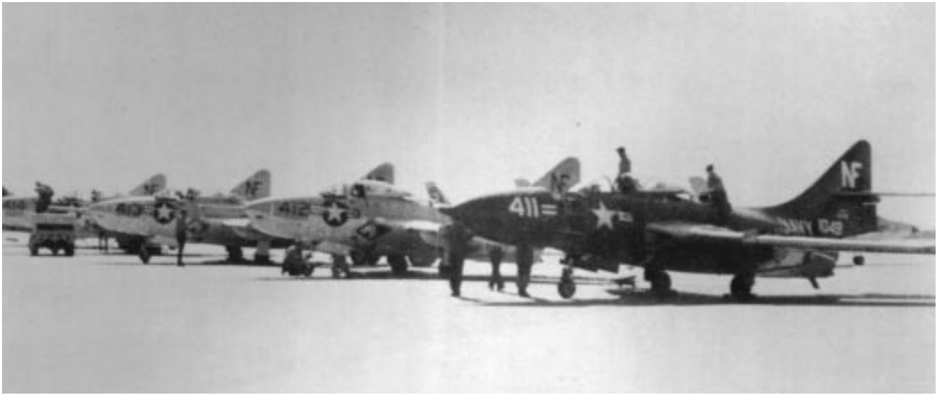
Squadron F9F-8B Cougars on the flight line at NAS Miramar, California, in 1958.