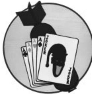
Following World War II, the squadron adopted this insignia.

that had been in existence prior to World War II. It was a winged devil's head with a red ball of fire and a black bomb with red markings. The devil's helmet and beard were black; the face and horn was red; yellow goggles and mustache; and red wings outlined in black.