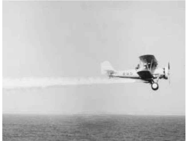
This photo shows a squadron O2U laying a smoke screen.

May 1949: VA-54 was the last fleet squadron to operate the SB2C aircraft. The squadron completed its Operational Readiness Inspection on 19 May and the last operational flight of the SB2C.