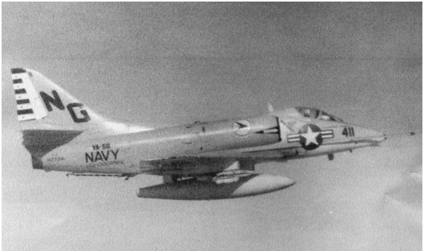
A squadron A-4C Skyhawk with Enterprise markings, 1966.