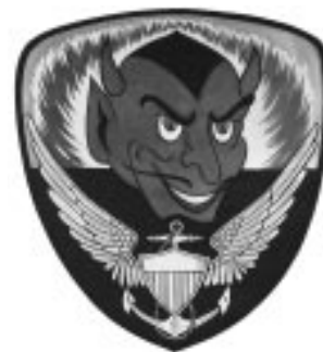
The squadron's last insignia, the devil's head, gave them the nickname "Hell's Angels."

eyebrows, mustache and highlights; his eyes were white with emerald pupils and vermilion iris; the mouth was white; and gold anchor, shield and wings. The squadron's motto was Angeli Inferni meaning Hell's Angels. When the squadron was redesignated VA-54 in 1956, it continued to use the Hell's Angels insignia.