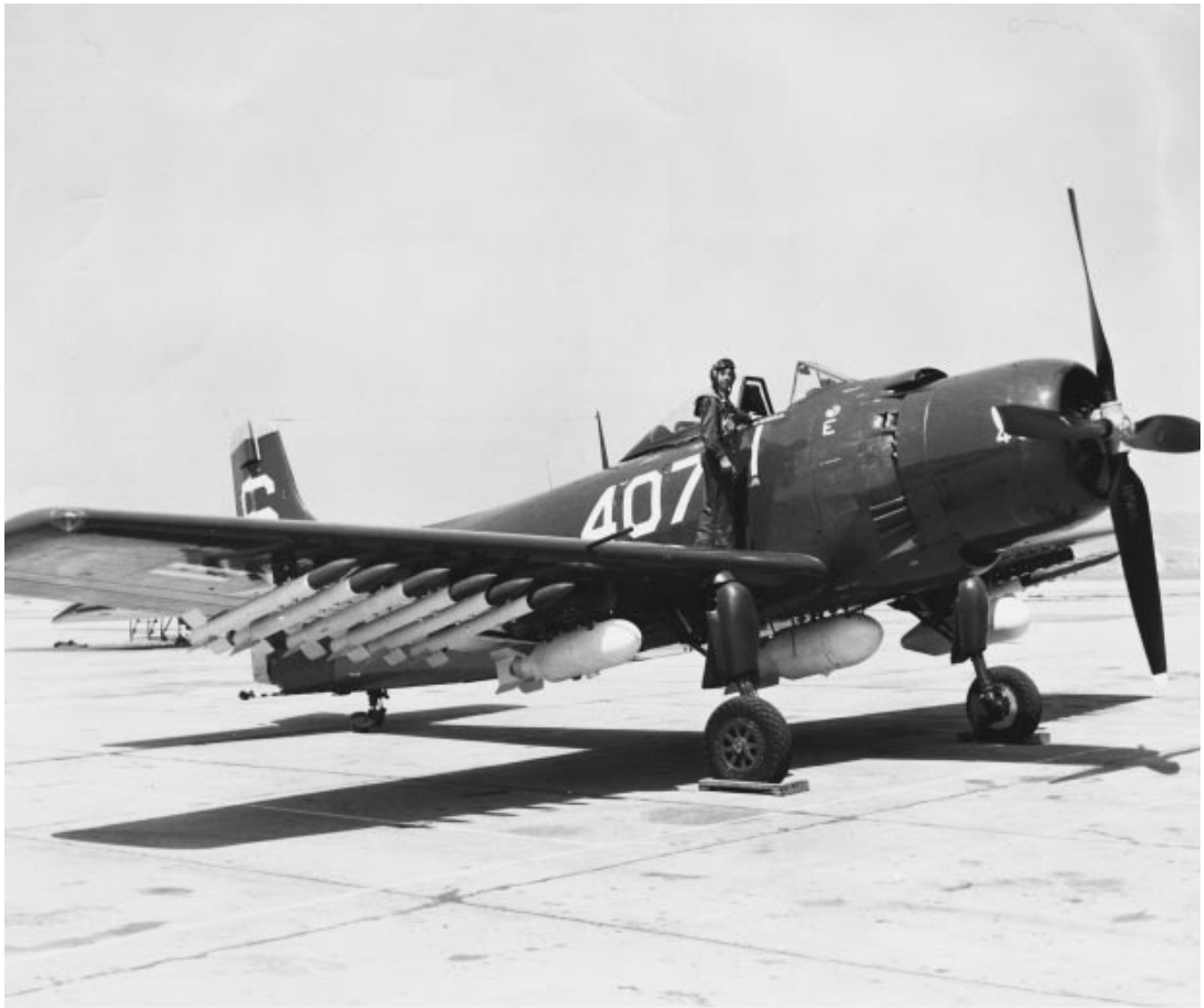
A squadron AD-1 Skywarrior loaded with dud rockets and general purpose bombs. The squadron's joker and card insignia and Battle E award are on the fuselage just forward of the pilot.