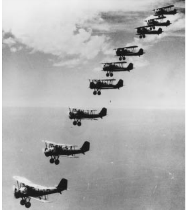
A formation of squadron SUs, circa 1933.

† Assumed command sometime between October 1939 and June 1940.