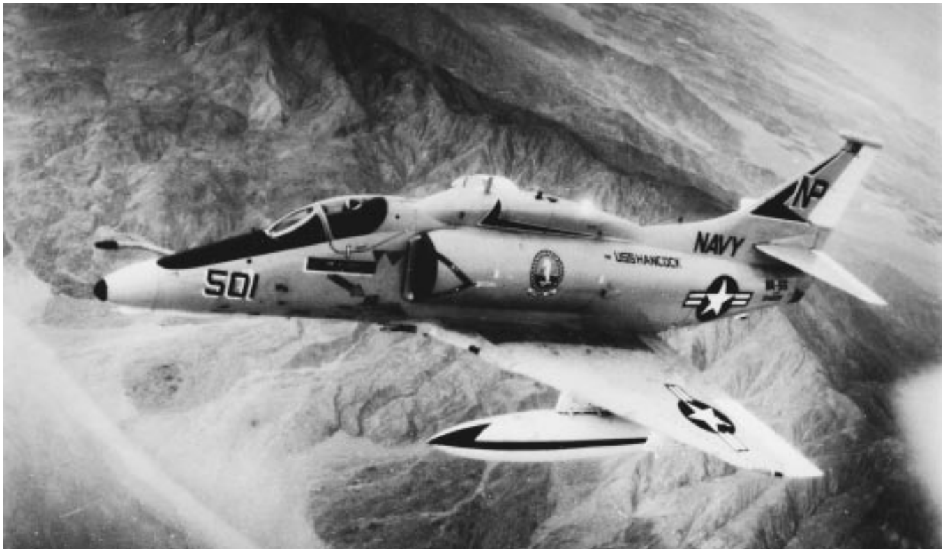
A squadron A-4F Skyhawk piloted by Lieutenant Duncan, 14 February 1975.