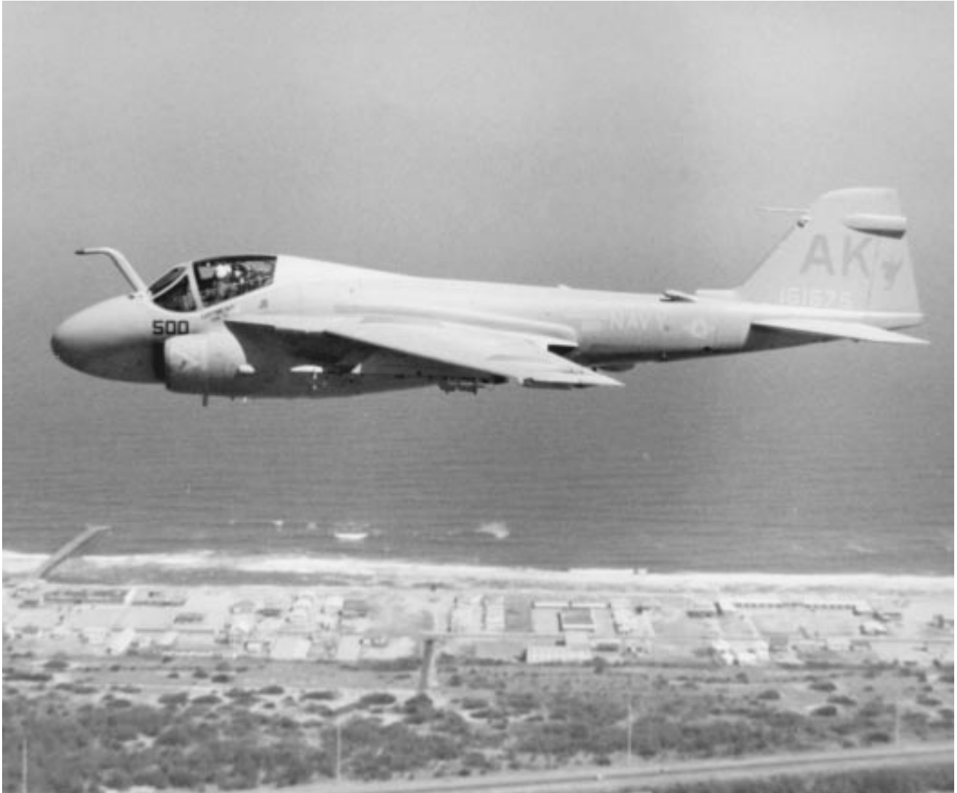
A squadron A-6E Intruder; note the flying seahorse insignia on the tail.