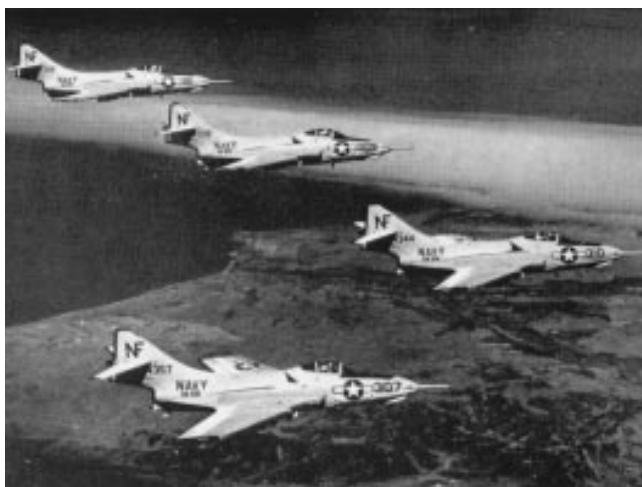
A flight of squadron F9F-8 Cougars that deployed aboard Bon Homme Richard's (CVA 31) 1957 WestPac cruise.

May 1986: The squadron was reassigned to NAS Lemoore as a result of the change in CVW-5's composition from A-7 and F-4 aircraft to FA-18A. It began the transfer of its personnel and aircraft in preparation for the disestablishment of the squadron on 31 August.