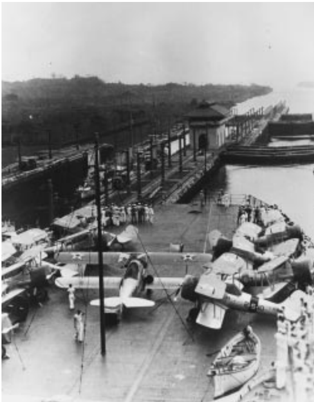
Squadron SU aircraft are parked on the forward flight deck of Lexington (CV 2) as she passes through the Panama Canal.