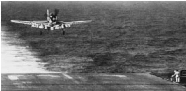
A squadron AD-6 Skyraider coming in for a landing on Kearsarge (CVA 33) during its 1955–1956 WestPac deployment.