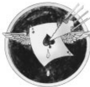
The squadron's second insignia, approved in 1948, depicts the nickname "Copperheads."

A new squadron insignia was approved by CNO on 14 February 1951, a year after the squadron had been redesignated VF-54. The insignia's design was based on the statement "through Hell or High Water." Colors for this insignia were: sky blue background in the upper half and sapphire blue in the lower half of the insignia, the overall insignia outlined in black; a crimson devil's head was encircled by yellow, red and amber flames; the devil's features include black hair,