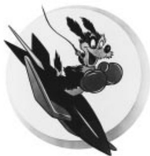
The squadron's first insignia was designed by Walt Disney Productions.

The squadron's first insignia was approved by CNO on 17 July 1945. The insignia was designed by Walt Disney Productions.