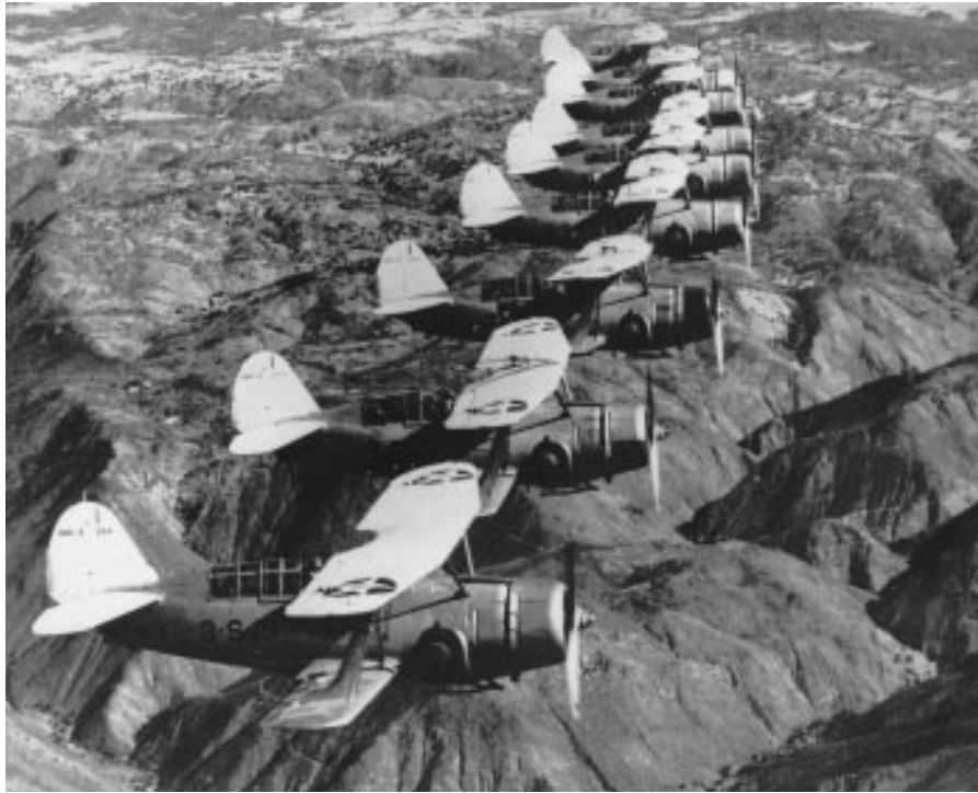
A formation of squadron SBC-3s in 1938 (Courtesy Robert Lawson Collection).