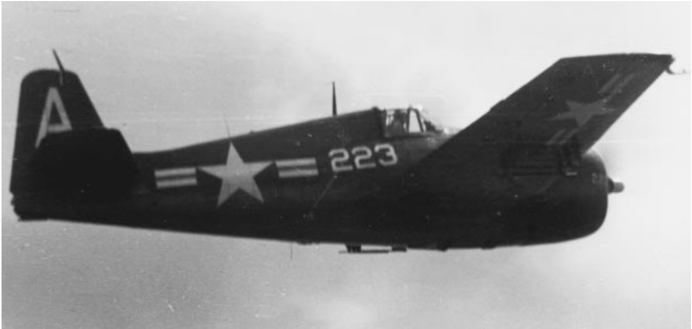
A squadron F6F-5 Hellcat in flight, circa 1947 (Courtesy Robert Lawson Collection).