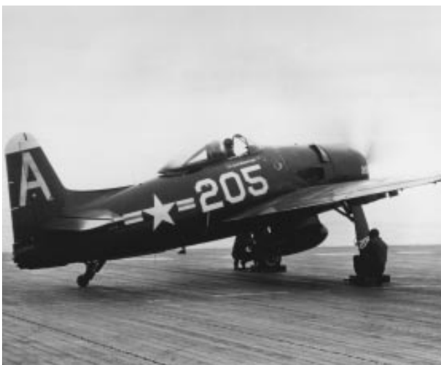
A squadron F8F-1 Bearcat on the deck of Tarawa (CV 40) in 1948.