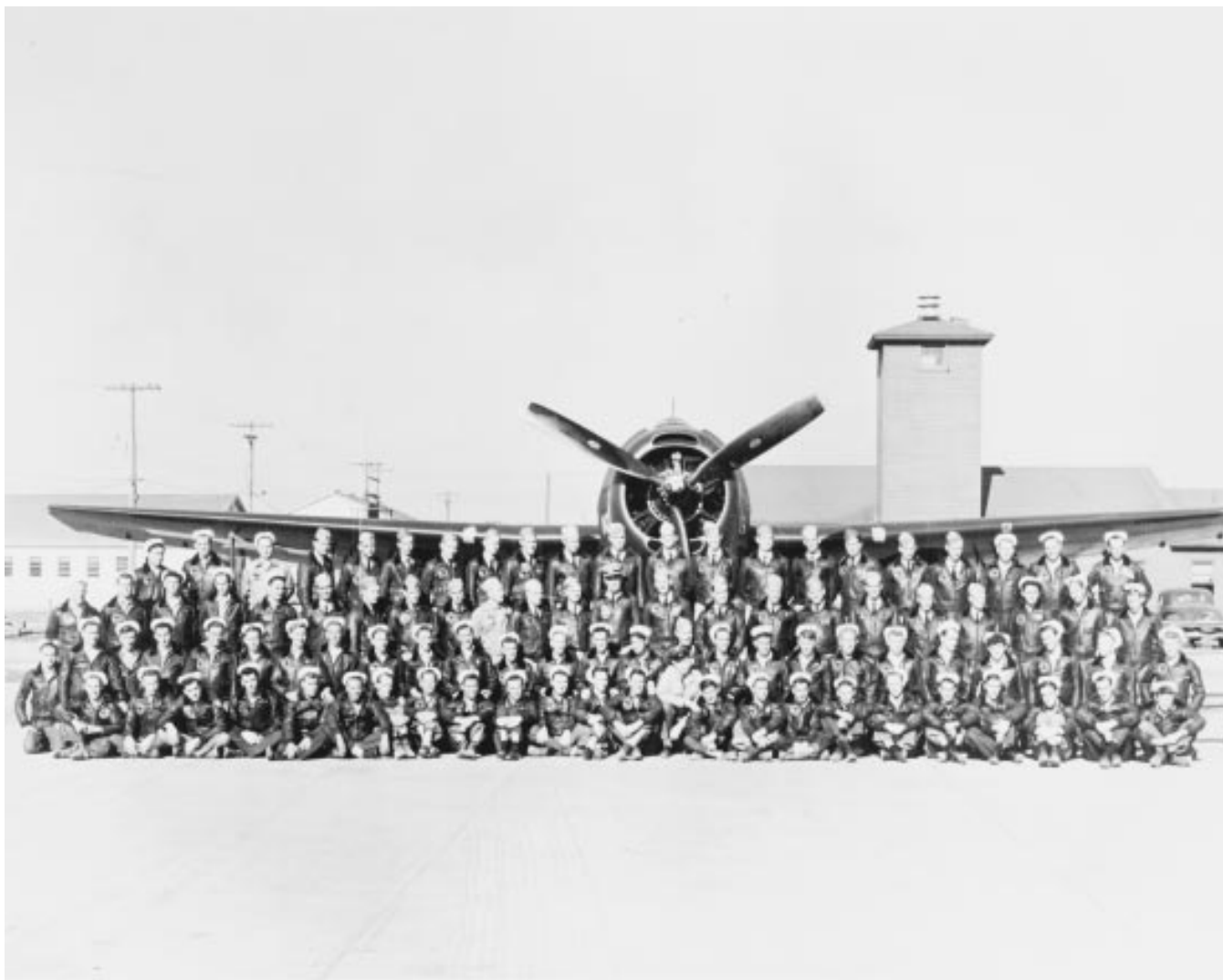
VT-5 flight crews in front of a squadron TBM-3. The squadron TORPCATS insignias on all the flight jackets, circa summer 1945.