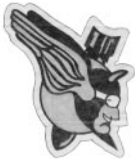
During World War II, the squadron adopted this insignia to keep it in line with its mission as a bombing squadron.