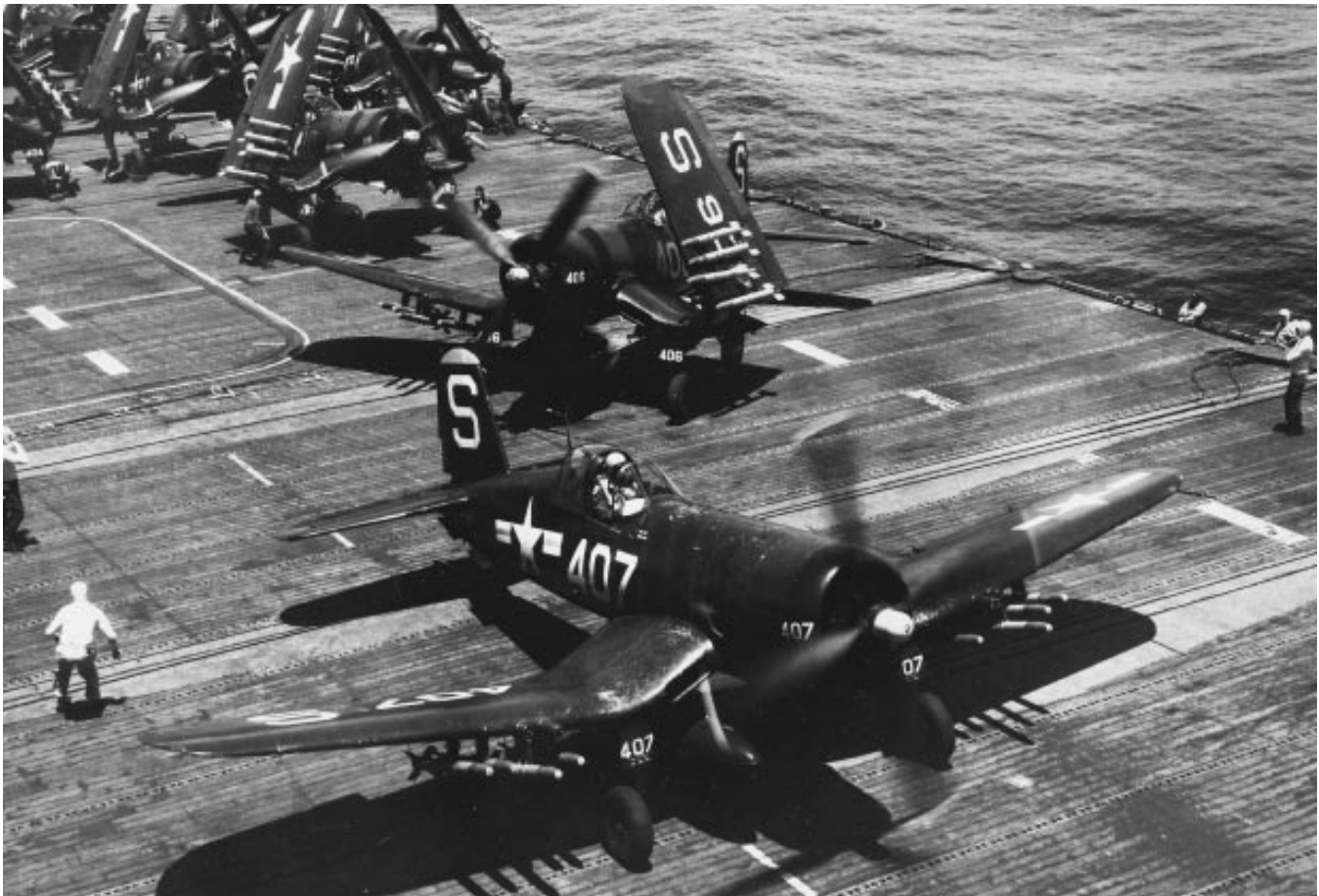
A squadron F4U-4B Corsair prepares to launch from Valley Forge (CV 45) during a combat deployment to Korea in 1950 (Courtesy Robert Lawson Collection).