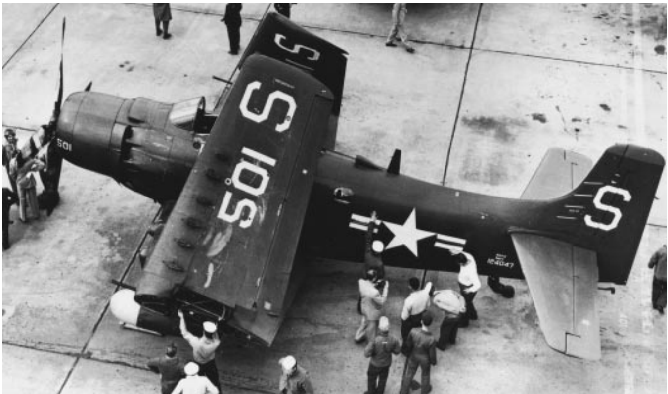
Squadron AD-4Q Skyraiders at NAS San Diego, California, in December 1950 following their return from a Korean combat tour aboard Valley Forge (CV 45) (Courtesy Robert Lawson Collection).