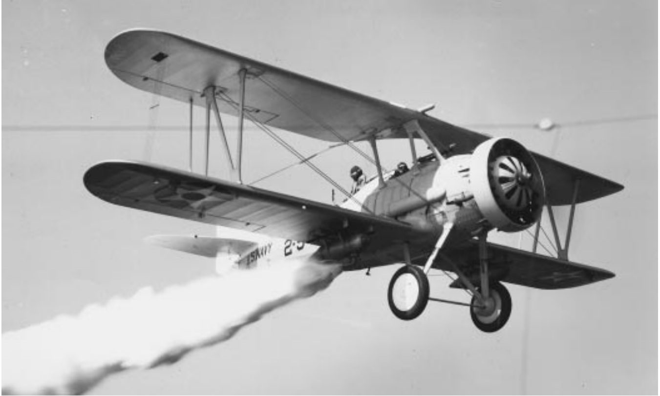
This is a close-up view of the squadron O2U laying a smoke screen.