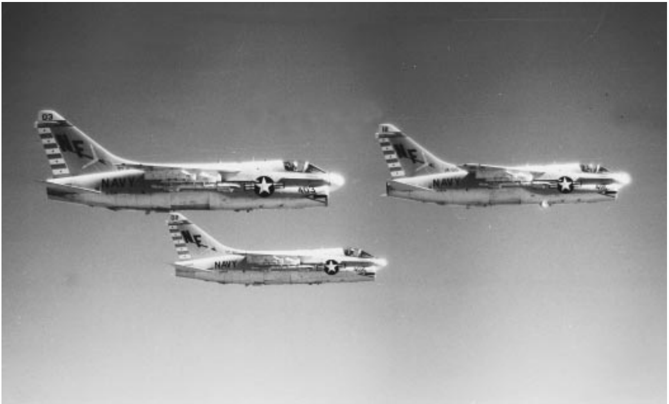
A flight of squadron A-7 Corsair IIs, 1973.