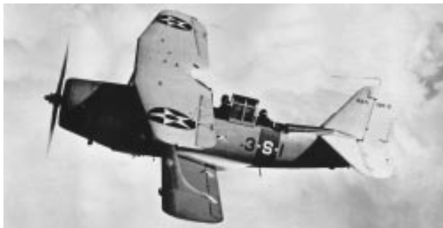
A close-up view of a squadron SBC-3 in flight. Part of the squadron's pointing bird dog insignia is visible on the fuselage just below the pilot.