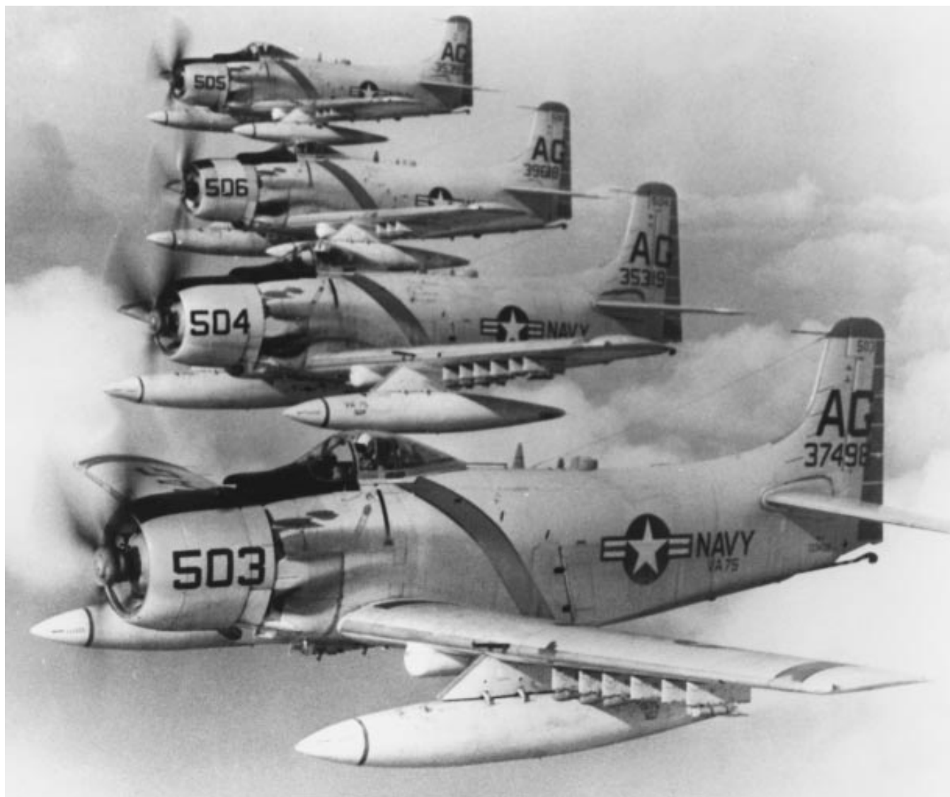
A formation of squadron AD-6 Skyraiders.