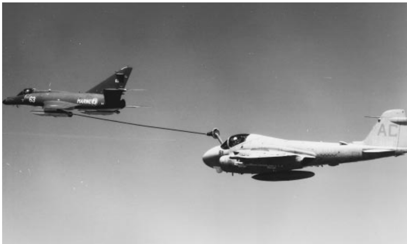
A squadron A-6E Intruder refuels from a French Super Etendard off Lebanon in 1984.