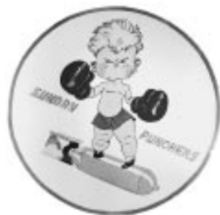
This insignia was used by the squadron from 1947 to sometime around 1950.

for the insignia of a boy riding a bomb were: a light blue background outlined in gold; Sunday Punchers lettering was medium blue and the VA-7A lettering on the trunks was gold; the bomb was medium blue with black highlights; the boy had tan skin with red cheeks,