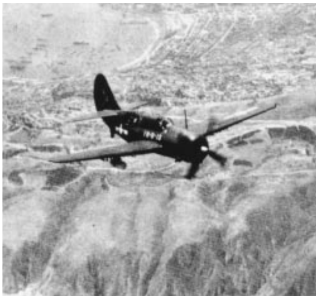
A squadron SB2C-5 Helldiver on a flight over Valparaíso Harbor during its goodwill cruise to South America aboard Leyte (CV 32) in 1946.