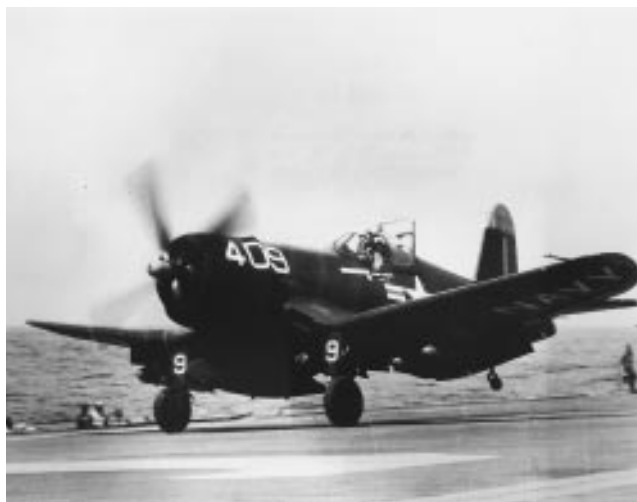
A squadron F4U-4 Corsair launches from Bon Homme Richard (CV 31), circa 1952.