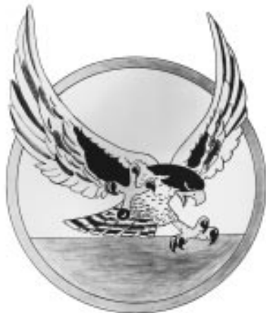
The hawk insignia was adopted by the squadron in 1950.

On 5 December 1950 a new insignia was approved by CNO. Colors for the peregrine falcon were: a red outline with upper background white and the lower background blue; the falcon had a black head with gray feathers and black markings; the beak, eye and feet were yellow with black markings and the tongue was red.