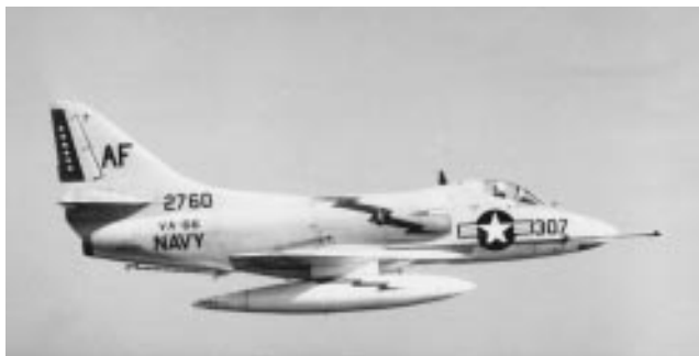
A squadron A4D-2 Skyhawk in 1959.

‡ VA-66 deployed with CVW-3 in John F. Kennedy (CV 67) in August 1986. Administratively, it continued to be assigned to CVW-7 until its official disestablishment on 1 October 1986. After that date, the same organization continued to operate as a detachment assigned to CVW-3 until the deployment ended in March 1987.