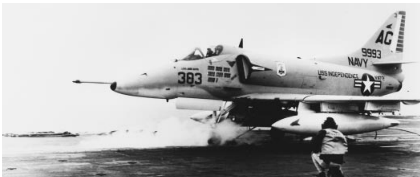
A squadron A-4 Skyhawk launches from Independence (CVA 62). Notice the combat markings on the aircraft just forward of the jet intake showing the number of combat sorties flown by the aircraft.