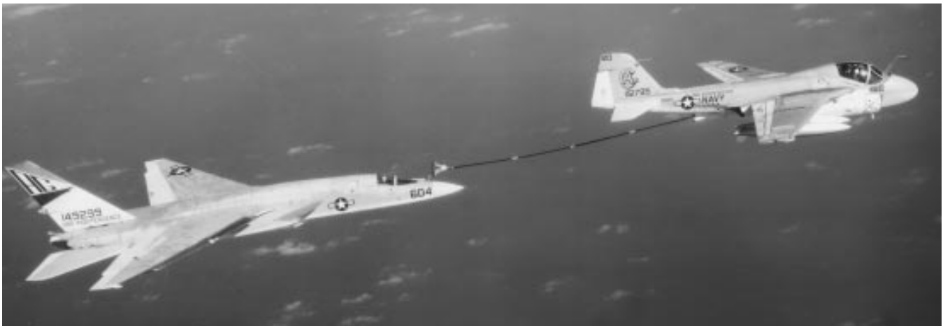
A KA-6D from VA-65 refuels an RA-5C Vigilante, 1971.