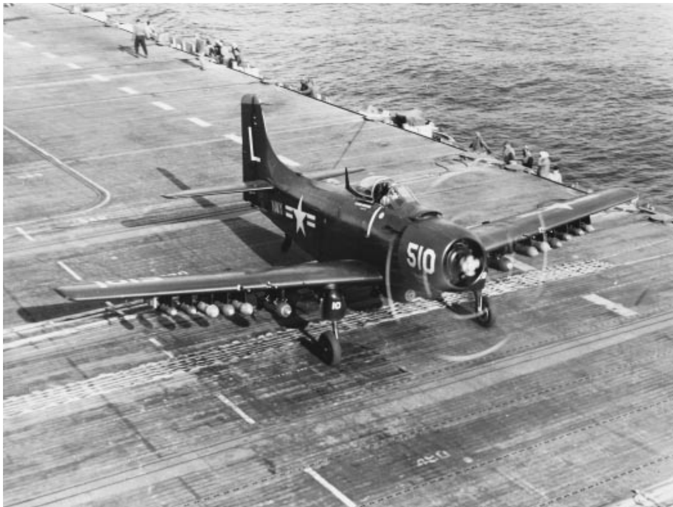
A squadron AD-4 Skyraider launches from deck of Bon Homme Richard (CVA 31), November 1952.