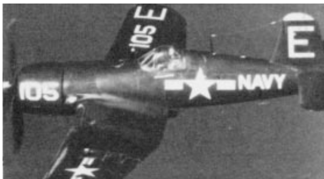
A squadron F4U-4 Corsair during its deployment to the Med aboard Tarawa (CV 40) in 1952.

31 Mar 1987: VA-66 Detachment was disestablished.