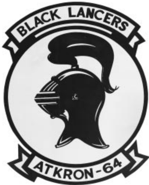
The Black Lancers' insignia.

The squadron's insignia was approved by CNO on 26 December 1961. Colors for the insignia were: a