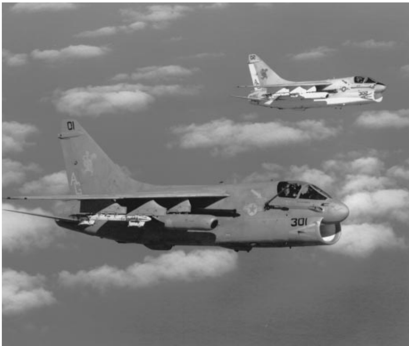
Two squadron A-7E Corsair IIs show the difference between the old and new paint schemes in 1984. The gun-toting rooster insignia is on the tail of both aircraft.