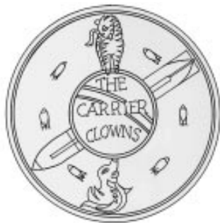
The Carrier Clowns insignia was used by VT-18.

1945. Colors for "The Carrier Clowns" insignia were: a blue background with an orange center and a dark blue strip through the center; the words "The Carrier Clowns" in black; a white Zebra with black markings; a black bird with white markings; orange bombs; and a torpedo with yellow tip,