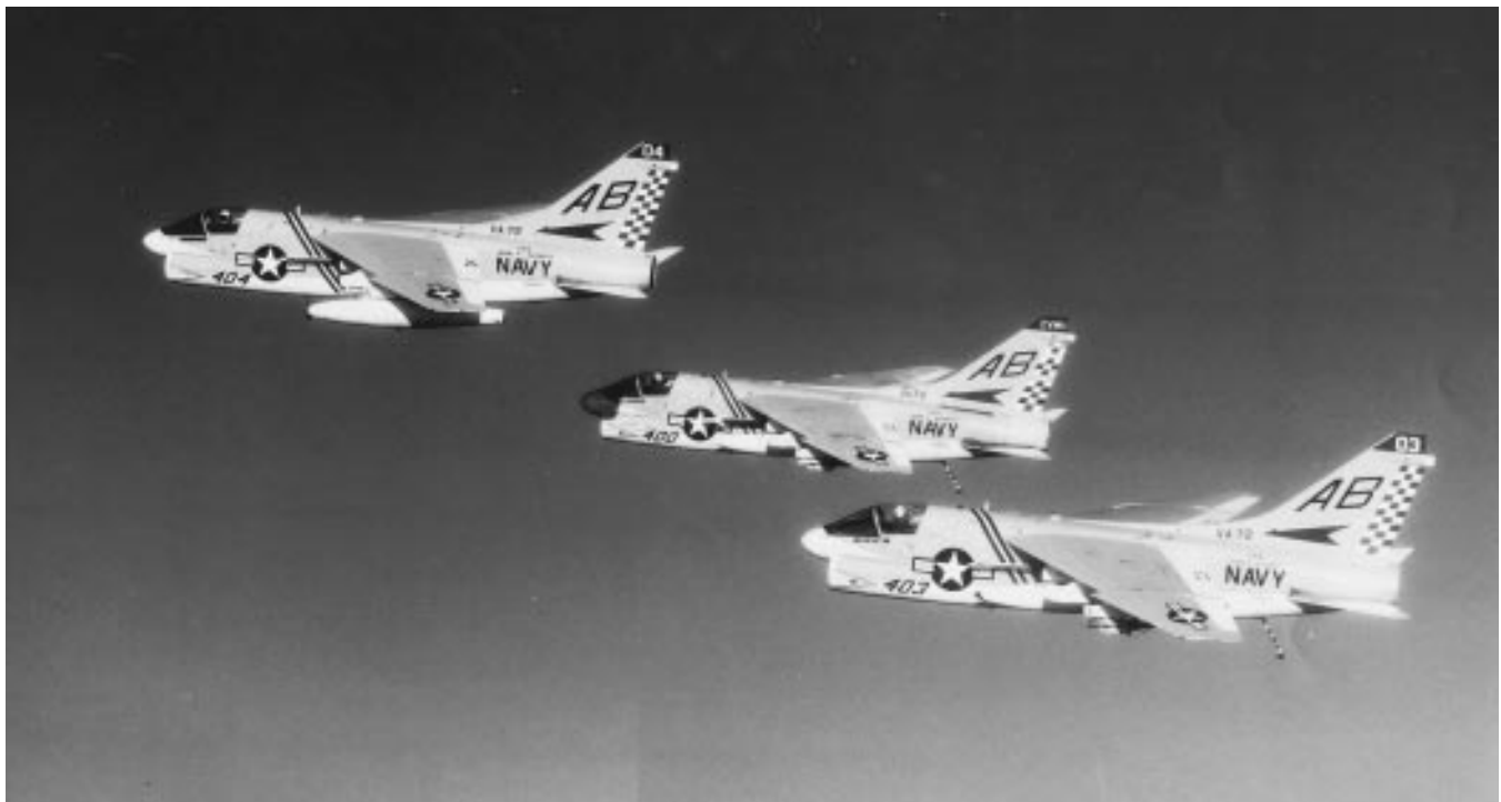
A flight of squadron A-7 Corsair IIs.