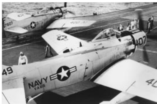
Squadron AD-6 Skyraiders are directed to the catapult aboard Intrepid (CVA 11) in 1961.