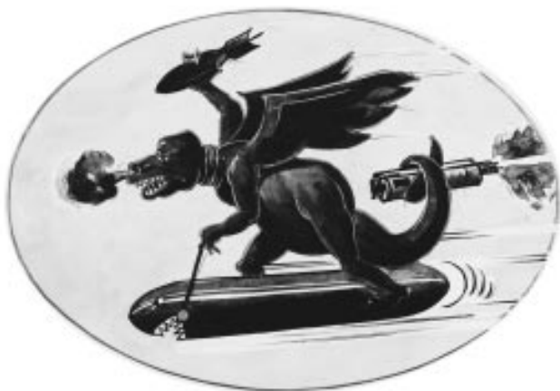
The beast was the squadron's first insignia. It was designed by the squadron when they were flying the SB2C, nicknamed the "Beast."

The squadron's first insignia was approved by CNO