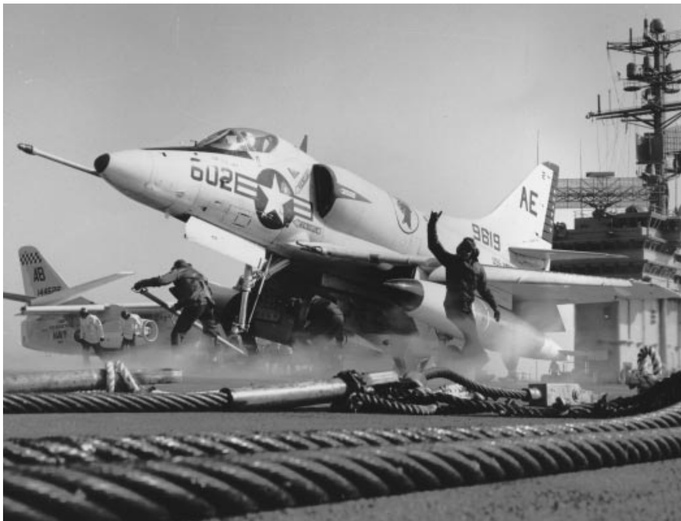
A squadron A-4C Skyhawk is prepared for launch from America (CVA 66) in 1965.