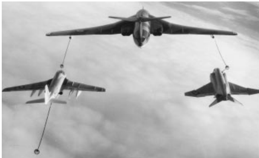
A British Victor tanker refuels a squadron KA-6D Intruder and an F-4 Phantom II. Note the refueling line and basket being trailed by the squadron's KA-6D.

* The award covers the competitive year 1948. † The award covers the competitive year 1967.