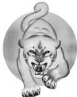
The squadron's last insignia, the prowling tiger, was in use for over 40 years and was a well-known insignia in naval aviation.

After VT-74 was redesignated VA-2B, it continued to use the old insignia until 17 April 1947 when CNO approved a new insignia for the squadron. The insignia adopted by VA-2B reflected the squadron's new attack mission. The horsehead chess piece was designed to relate the squadron's power to that of a medieval knight and the fleur-de-lis represented integrity. Colors for the insignia were: a yellow background; red scroll with yellow lettering, black banner with a black and white pole; white knight with a yellow collar; a white lightning bolt; and the Fleur-de-lis was red with a black band.