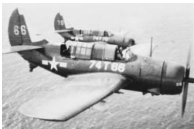
A rare photo of a squadron SB2C in post-World War II markings. What is even more interesting is the fact that a torpedo squadron was assigned an aircraft designed primarily as a bomber.

26 Mar 1993: The squadron held a disestablishment ceremony at NAS Oceana, it was officially disestablished on 31 March 1993.