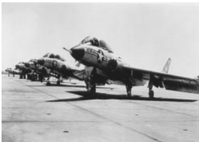
A squadron F7U-3 Cutlass on the flight line, believed to be at NAS Port Lyautey, Morocco. The squadron was stationed at the air station during part of its 1953 Med cruise.