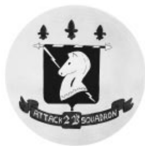
Following the squadron's redesignation as an attack squadron, the knight chess piece insignia was approved.

on 9 August 1945. During the time when the squadron's insignia was approved, VT-74 was flying the SB2C which was nicknamed the Beast. Consequently, the squadron's insignia took on the shape of a beast riding a torpedo. There is no record of the colors used for this insignia.