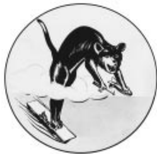
The bearcat was the squadron's first insignia.

The squadron's first insignia was approved by CNO on 9 April 1946. Colors for the bear-cat insignia were: