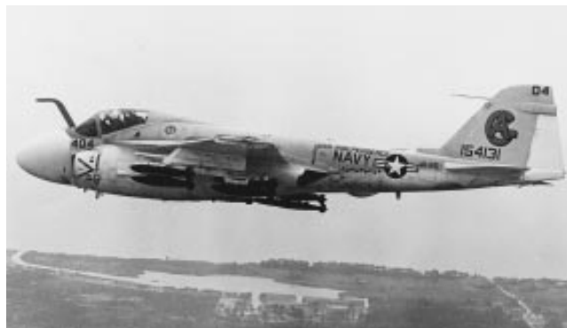
A squadron A-6A Intruder in flight with a load of bombs, 1970.

† The KA-6D was received sometime between April and June 1971.