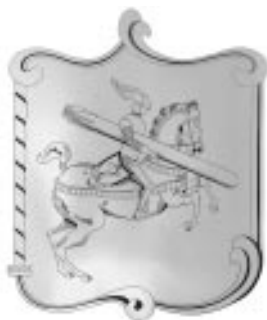
Following the squadron's redesignation to attack, the knight insignia was approved

Nickname: The Carrier Clowns, circa 1943–1946.