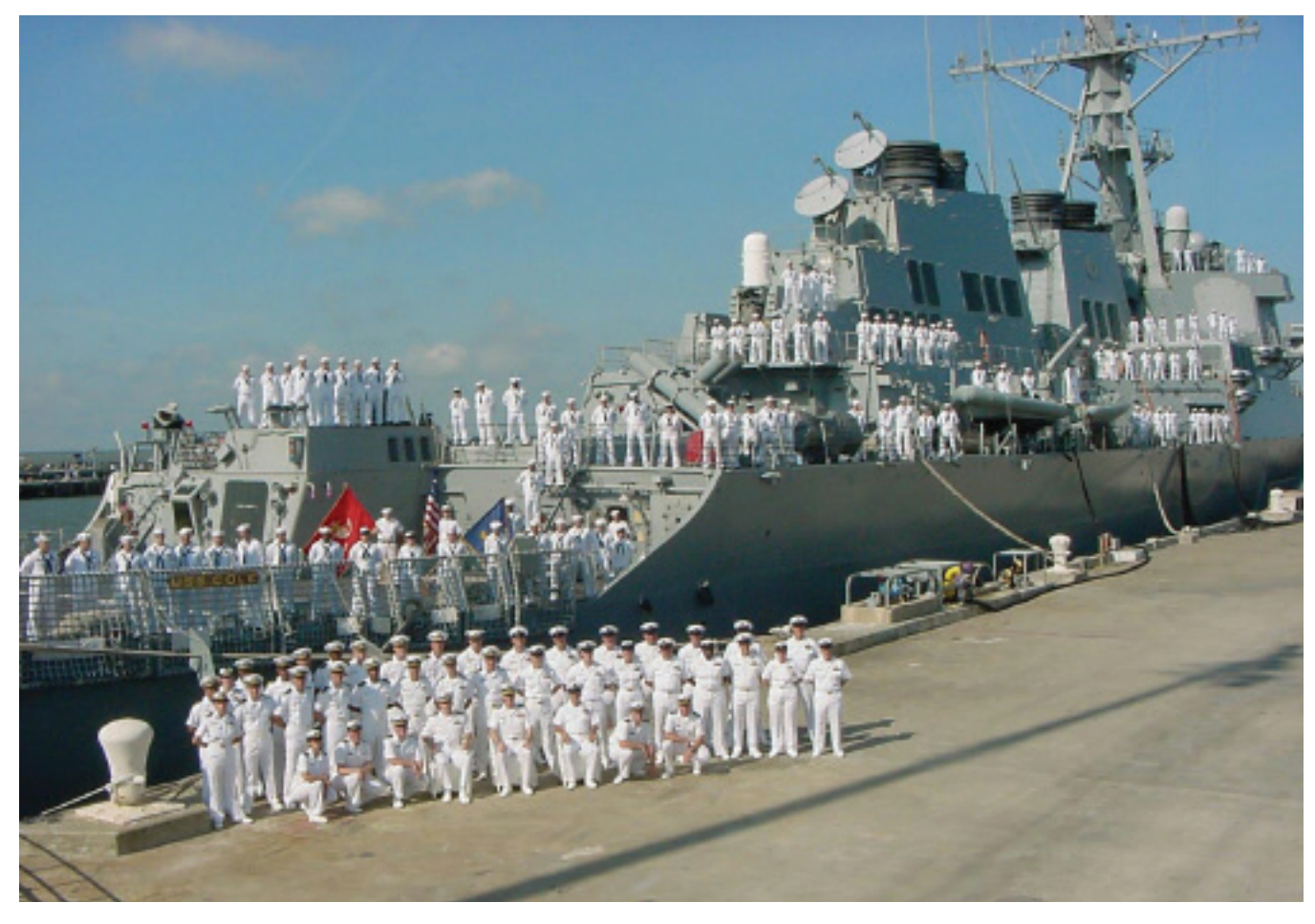
USS Cole's crew with their ship in August 2000.

For the citizens of this great nation, know that I see the reflections of the Cole heroes in today's Sailors. The American fighting spirit is alive and well, and the legacy of