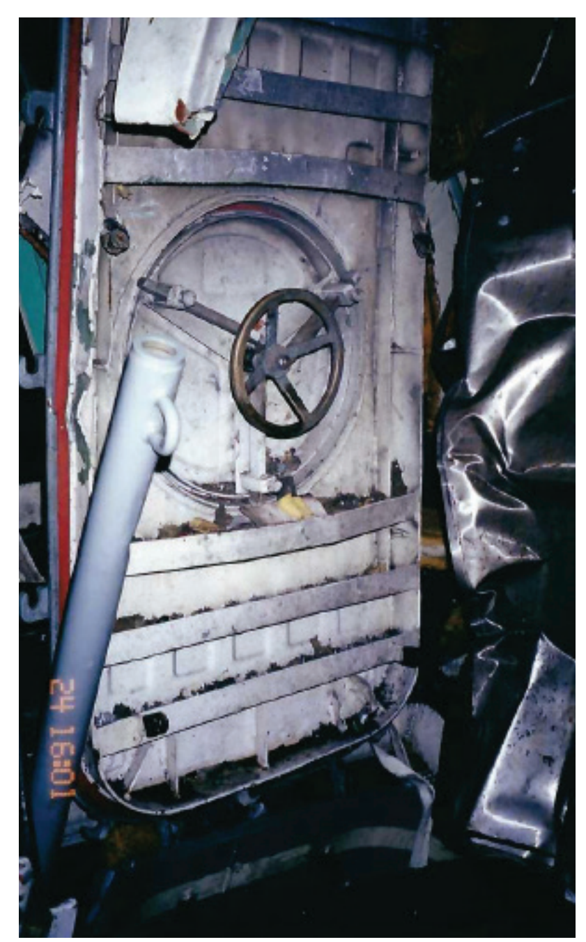
When the ship was hit, this watertight hatch was blown open and could not be closed again.

We went back into the chief's mess. There were other injured personnel in the chief's mess and we did the same-find the person, get them out of the chief's mess. We got to the beverage line in the chief's mess, which is parallel to the center line. It's the centermost part of the compartment. There was a chief there that was very, very injured. Still alive when we got there, but he did pass away. Looking at his injuries, we didn't feel like there was