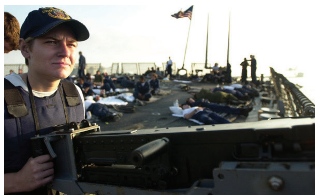
A gunner's mate is on duty, manning the gun and watching for further threats, while some of the crew relaxes in the background.

just totally messed up. All four main engines were damaged. Believe it or not, the shaft was bent, the port shaft. It even bent the masts—that's the energy that went through this