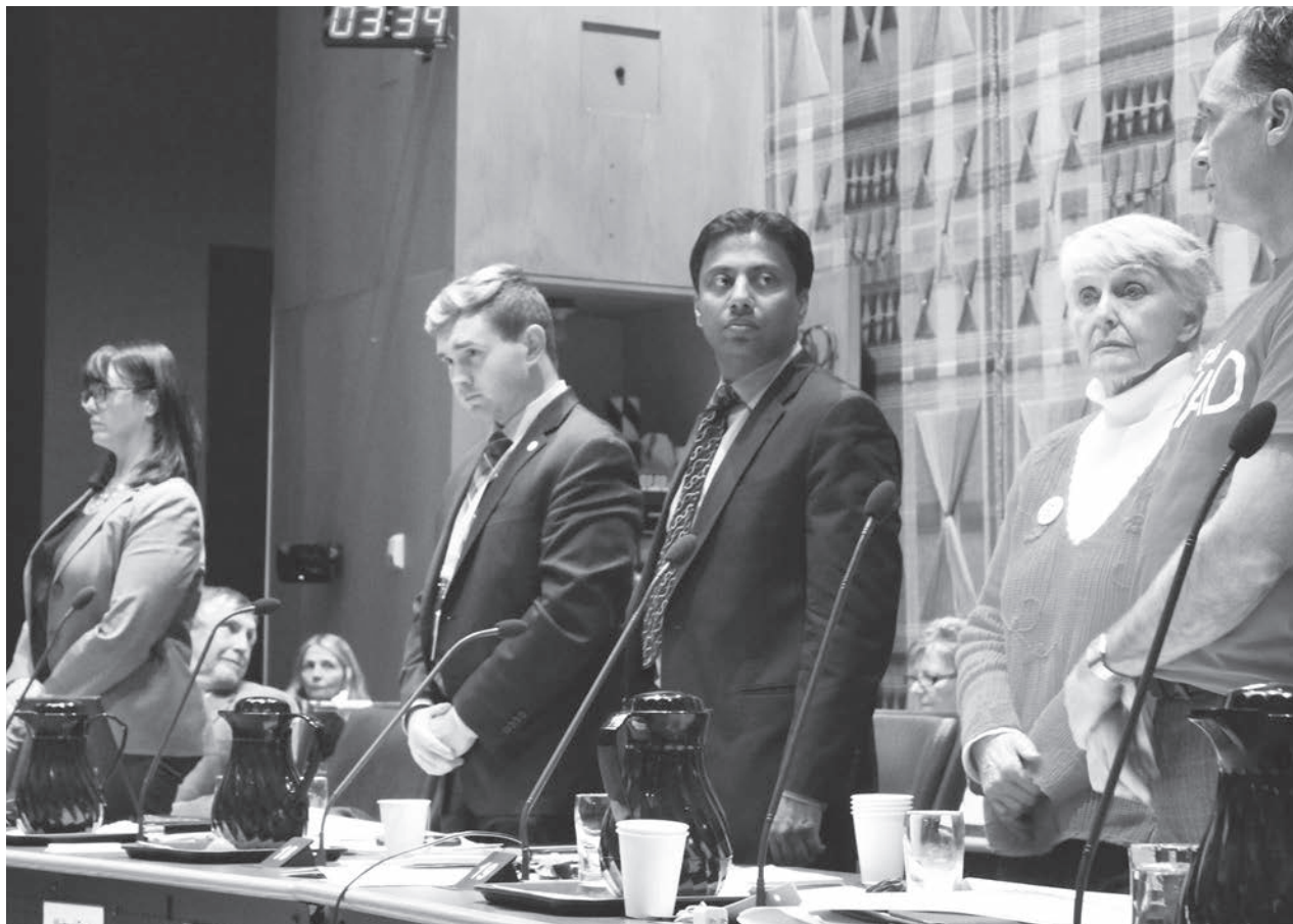
Bianca Quijano // The Observer