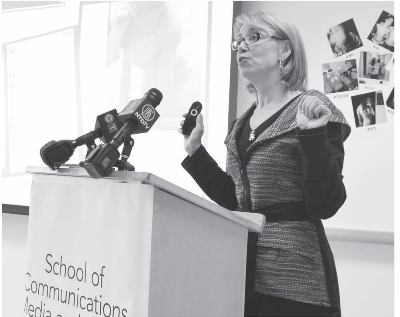
Nina Rayners /// The Observer

The research findings include video, audio and feature stories, as well as online tools that can be accessed to monitor the social media playing field.