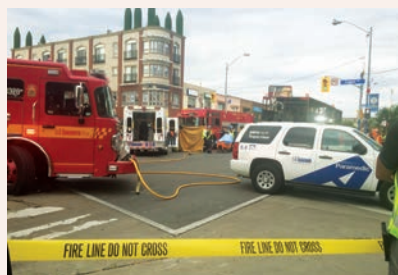
Danforth and Logan avenues after a worker was scalded by hot tar.

Officials said he had been wearing his protective suit and full safety gear. But he still suffered first-degree burns and was rushed to Sunnybrook Hospital. His condition was initially listed as critical, but was later upgraded to serious.