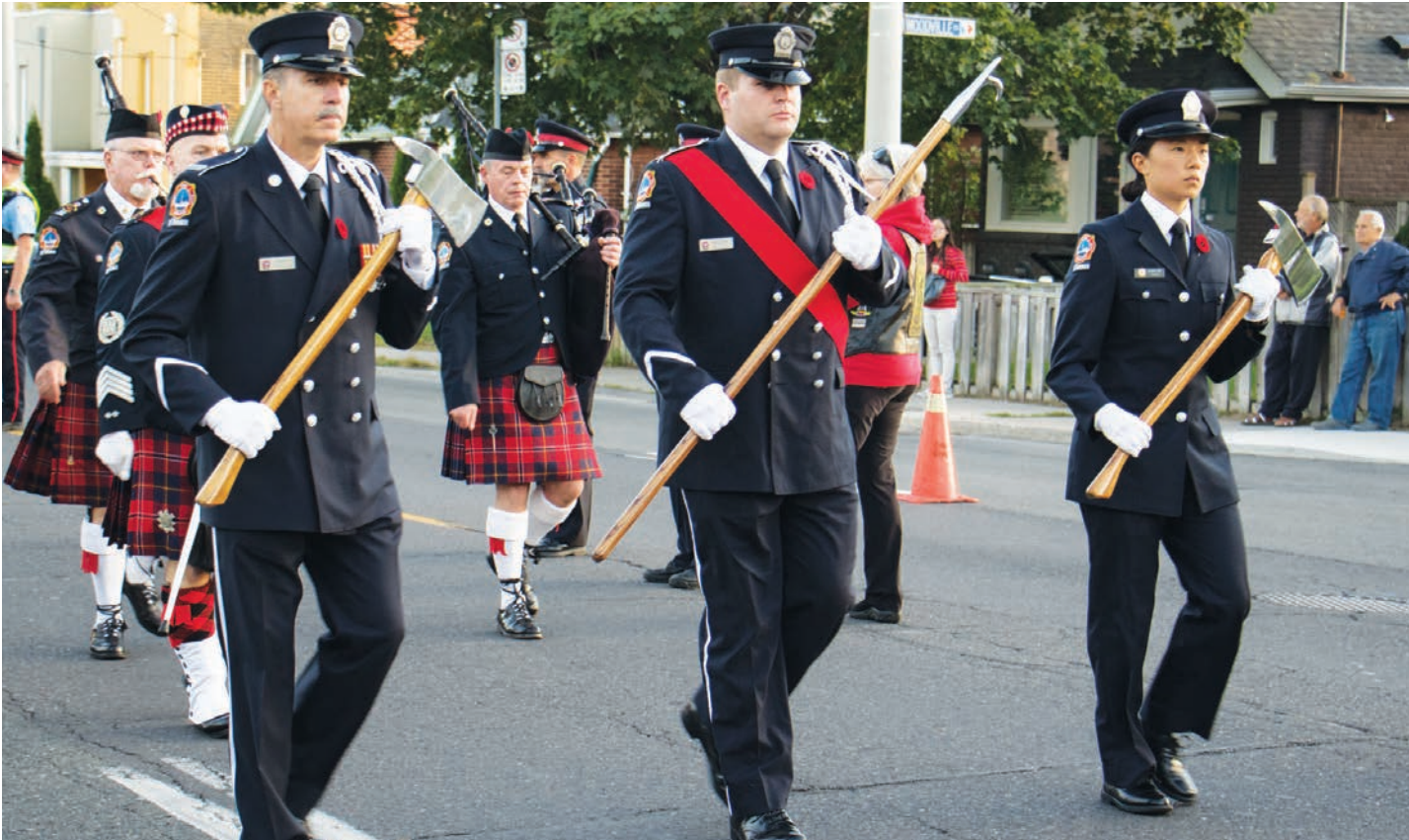
On Sept. 25, the Royal Canadian Legion, Todmorden Branch No. 10, held a memorial march and candlelight service in honour of soldiers who have ended their own lives due to PTSD. The march began at 6:30 p.m. at Cosburn Avenue and Todmorden Lane and then headed north to the Legion at 1083 Pape Ave. The candlelight service followed at dusk.