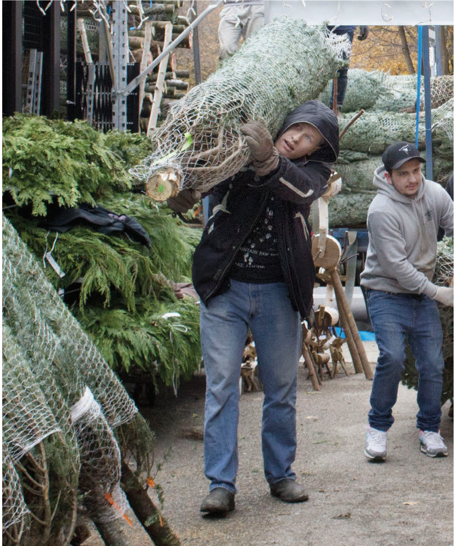
Cellie Agunbiade/The Observer