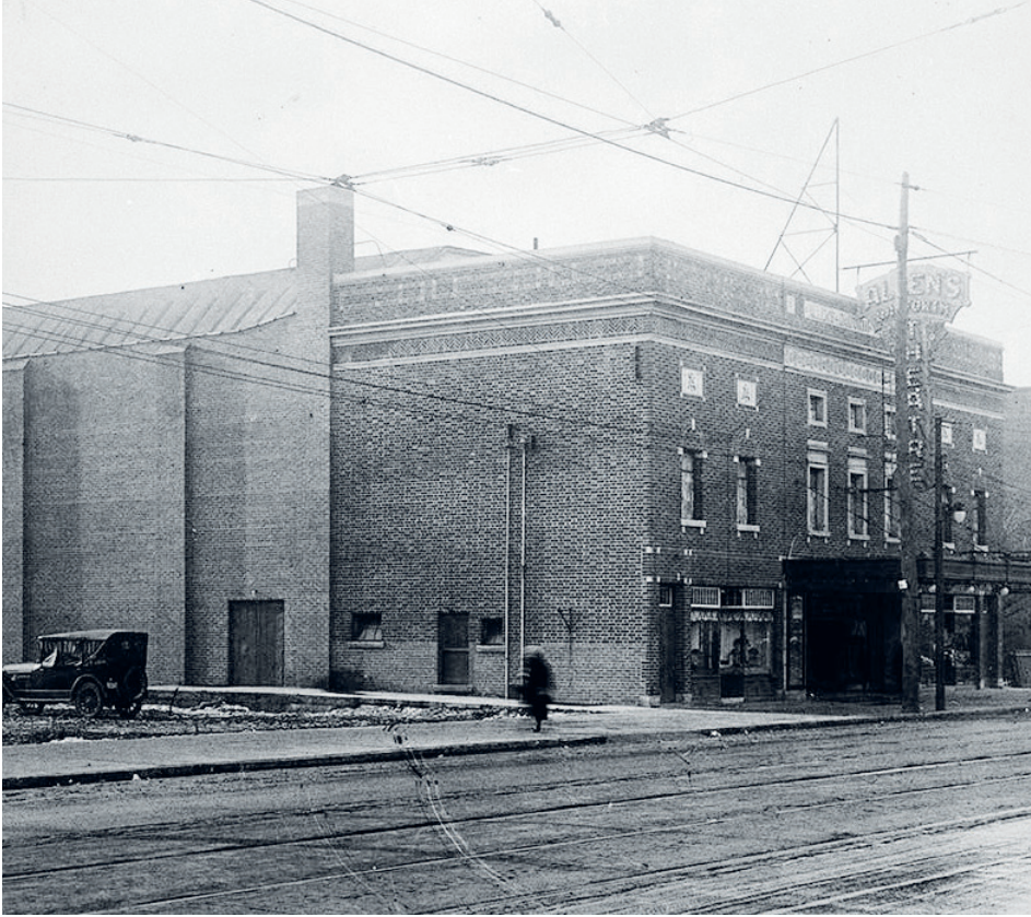
James Salmon Victor/City of Toronto Archives