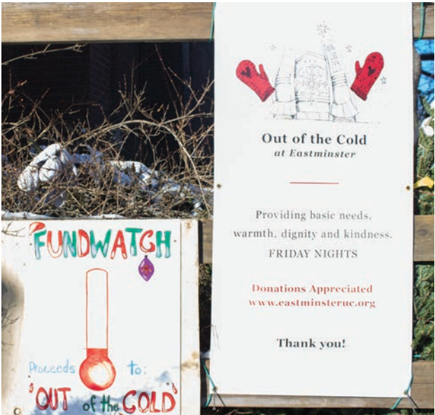
Tina Adamopoulos/The Observer