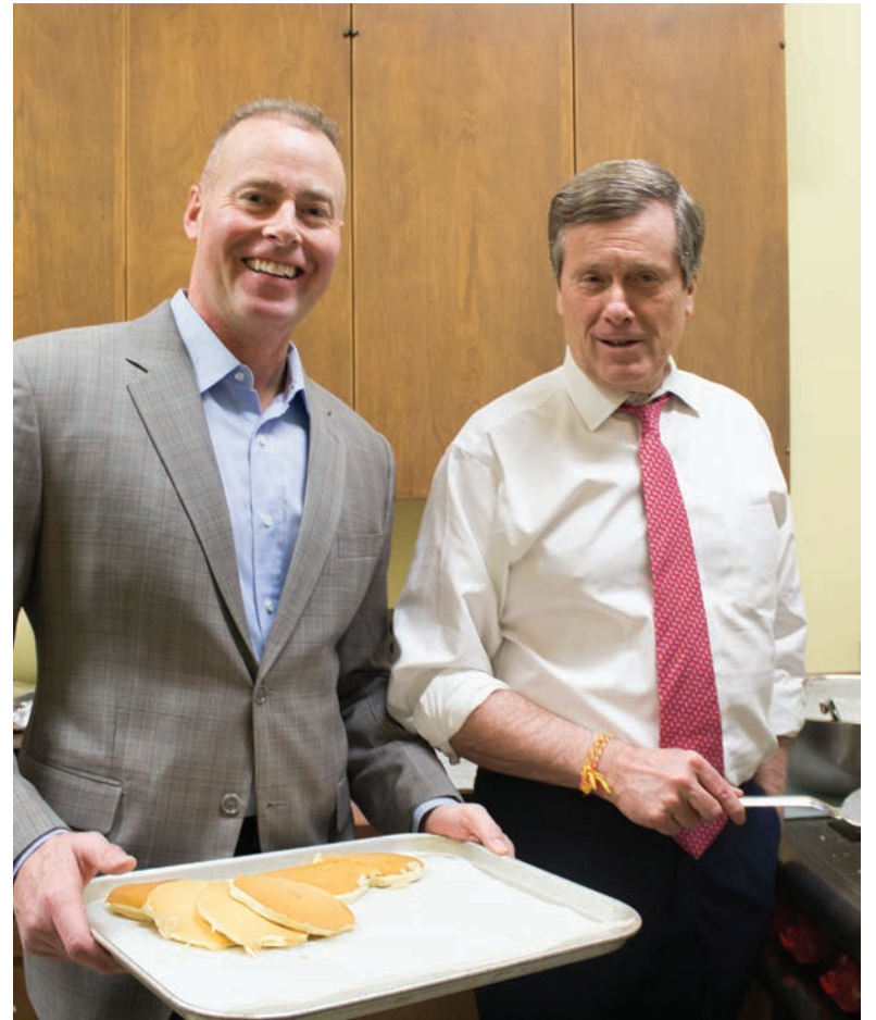
Kasy Pertab/Toronto Observer

"We've agreed to hold off on moving forward with the lawsuit, for now. We're not dropping it altogether, but we're not pushing it hard."