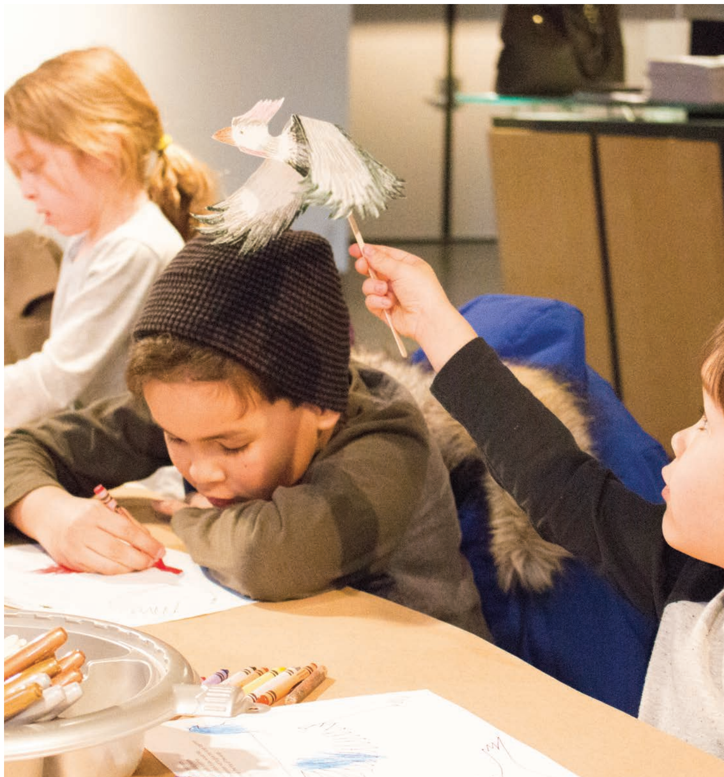
Trisha Sales/ The Observer