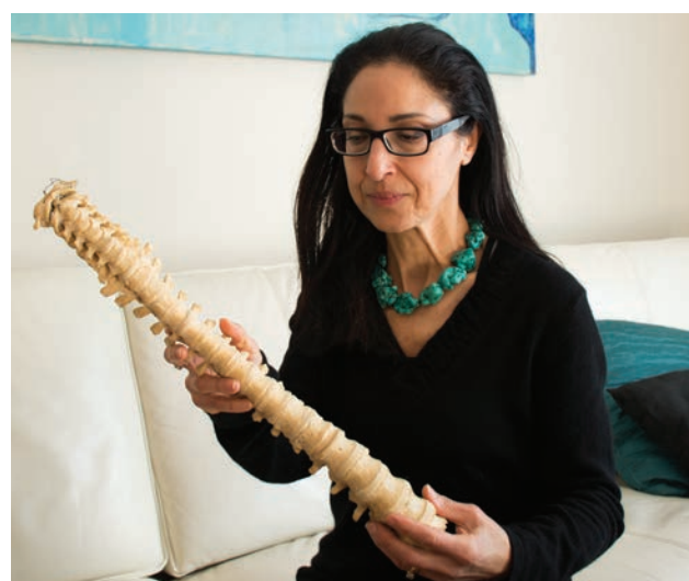
Ellen Samek/The Observer