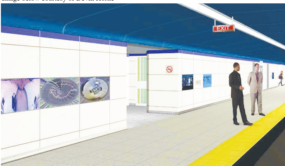
(Above) A blend of new and old “art” at Pape Station, photographed from the opposite platform.