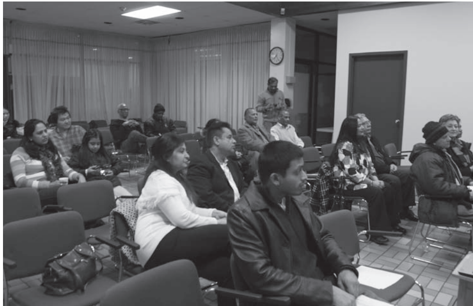
Right: Audience members watch the documentary intently during a screening held at the Crescent Town Community Centre.