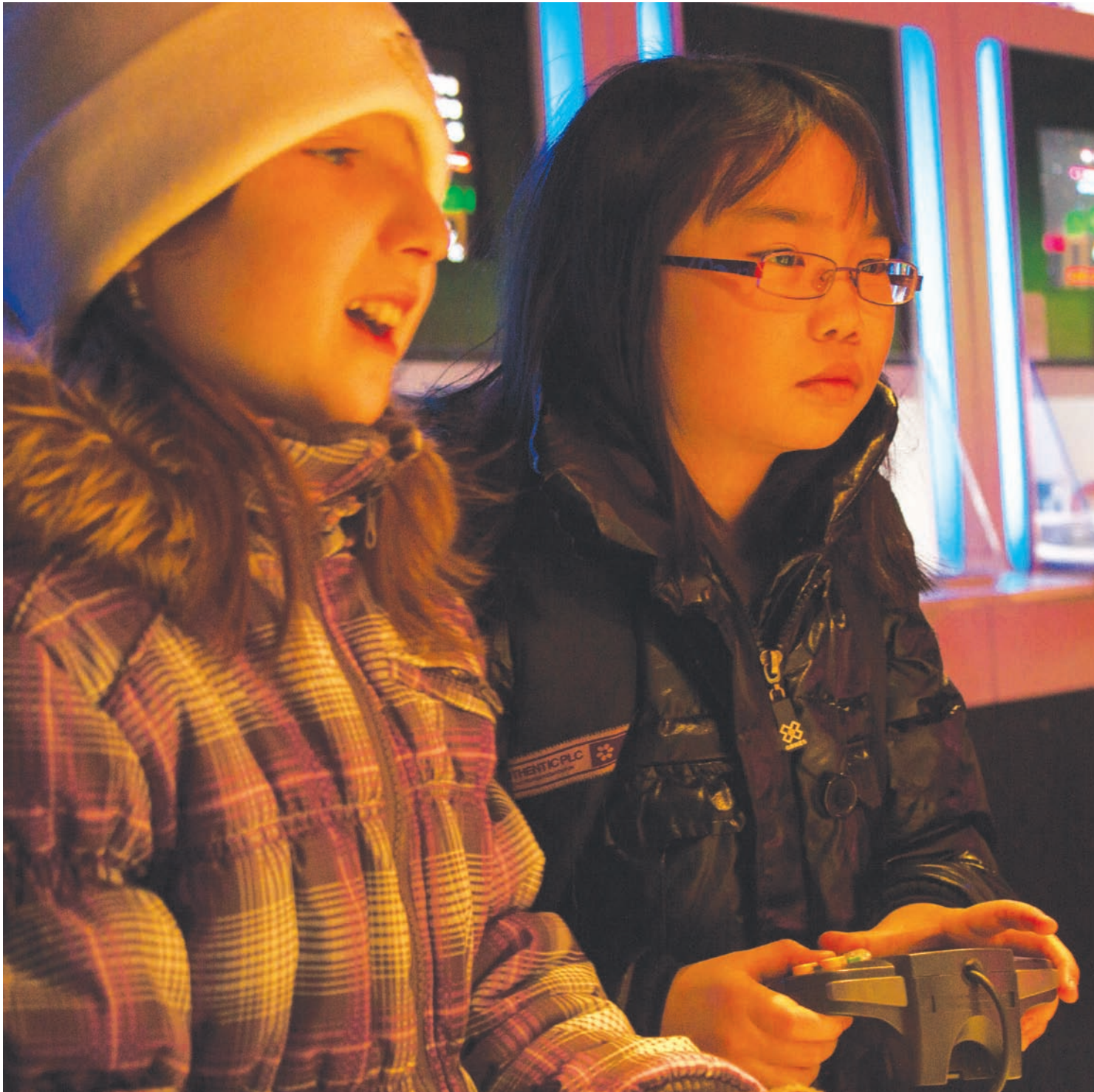
Robin Dhanju /// Observer