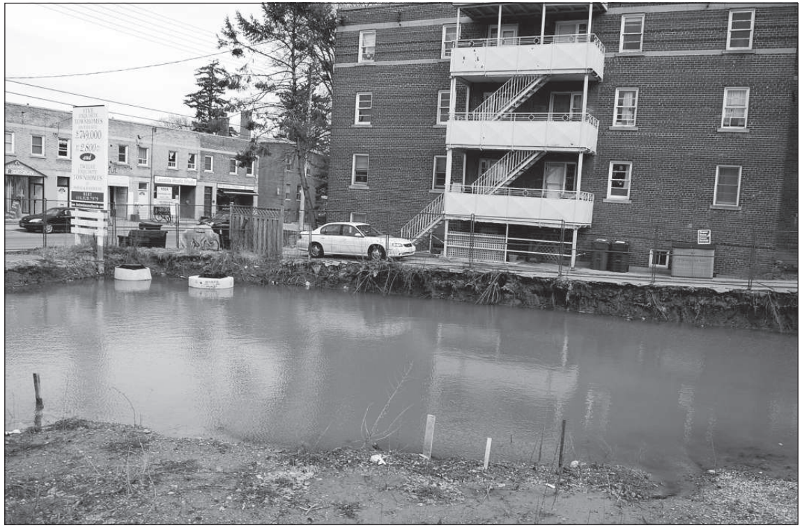
Meri Perra, Observer

GREAT LAKE LEASIDE: Murky green water fills a large hole in a vacant lot at the corner of Millwood and Rumsey roads in South Leaside. Neighbours are looking for a solution to their water-filled problem neighbour. The developer still hopes to sell five townhouses on the site.