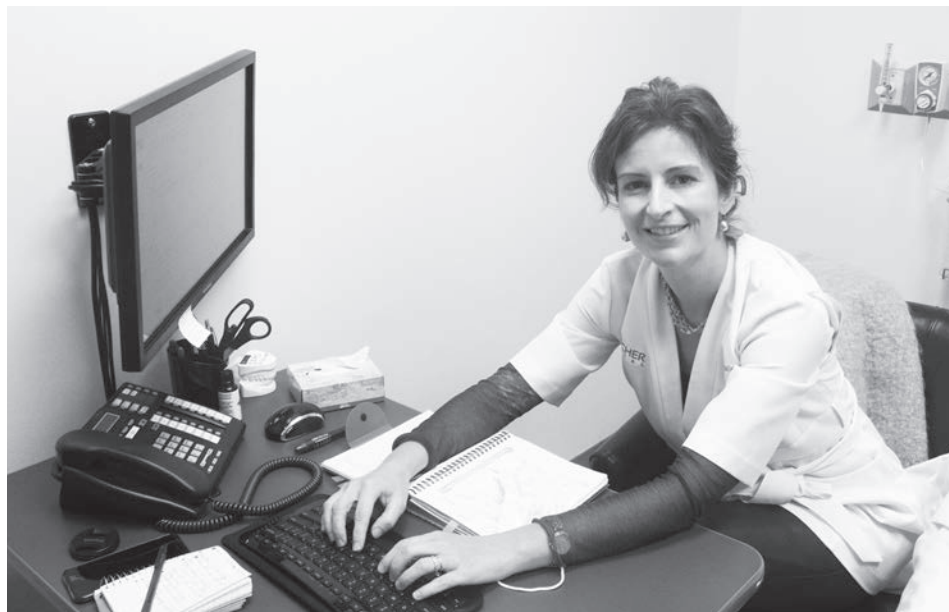
Marwa Mohkam Sheikh /// The Observer

Canadians are used to having relatively easy access to dental care. When patients need a toothache attended to or a teeth cleaning, they can walk into a dentist's office and remedy the