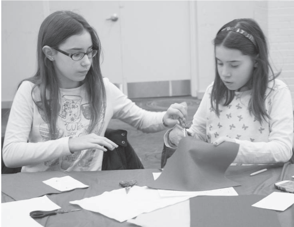
Suzanna Dutt // The Observer