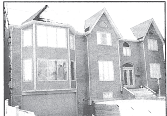
MONSTER HOMES: The phenomenon alarmed some East Yorkers, who saw newcomers buying small homes on big lots and replacing them with the so-called "monsters." Parkview Hills residents hotly debated the formula in public meetings early in 1989.