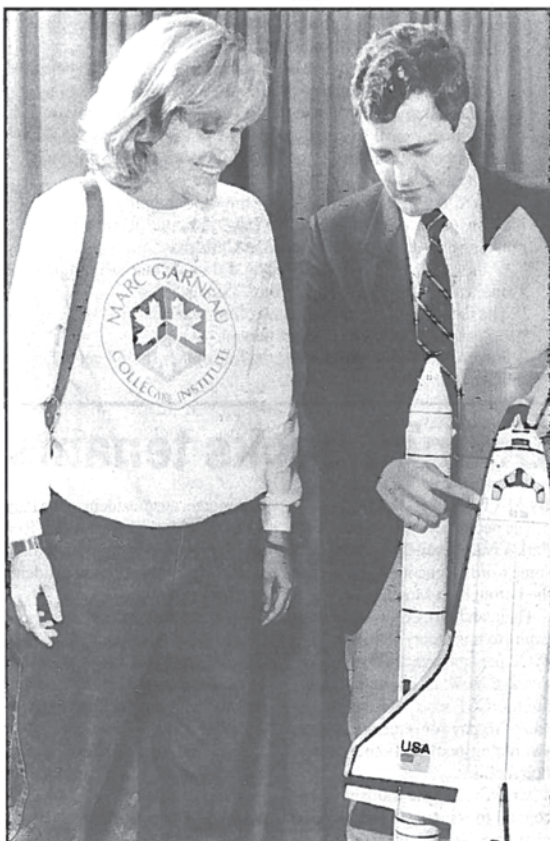
SCHOOL'S NAMESAKE: Astronaut Marc Garneau discusses his space voyage with student Svetlana Sreckovic during 1987 ceremonies to rename Overlea Secondary School. Besides adopting Garneau's name, school launched new high-tech programs.

A spectacular natural gas explosion instantly levelled one Coxwell Avenue house and trapped a woman in her burning home next door. Damage to the neighborhood was estimated at $800,000 and left the area littered with debris.