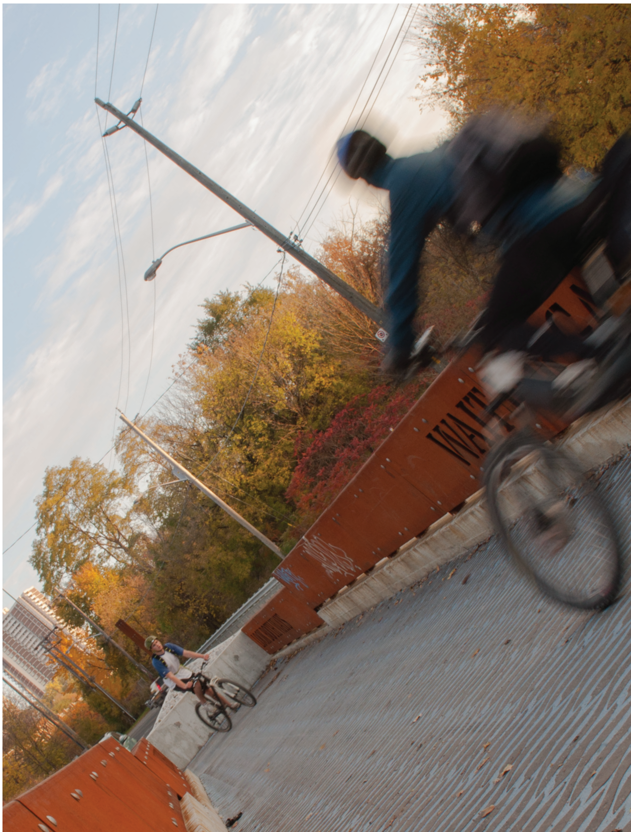
Nick Tragianis /// Observer