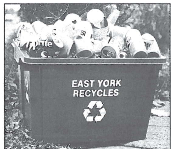
PITCHING IN: The blue box recycling program came to the borough this year, and East Yorkers pitched in with a passion. At year's end, the program was expanding to apartments and schools.