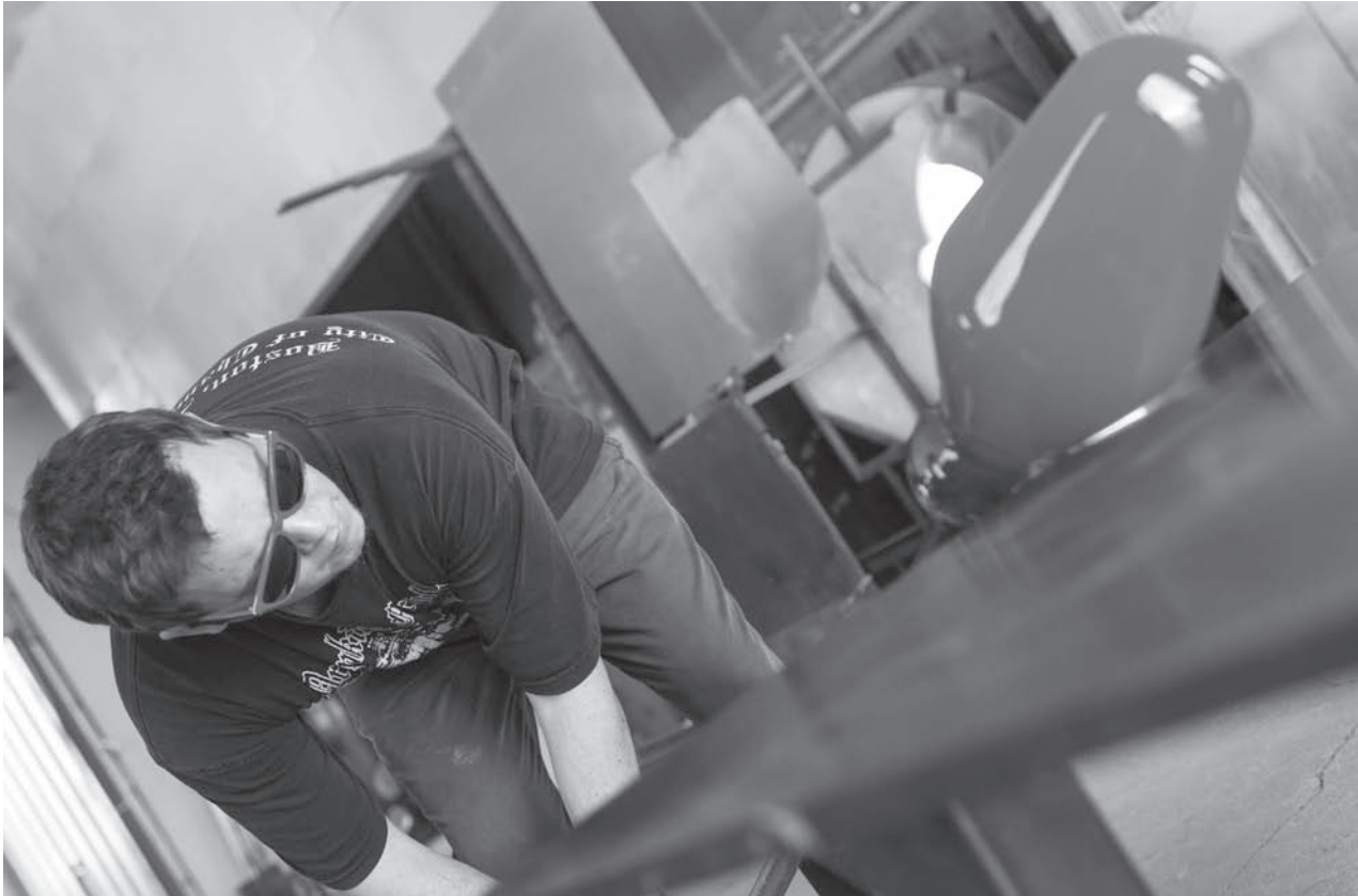
Matthew Wocks /// Observer