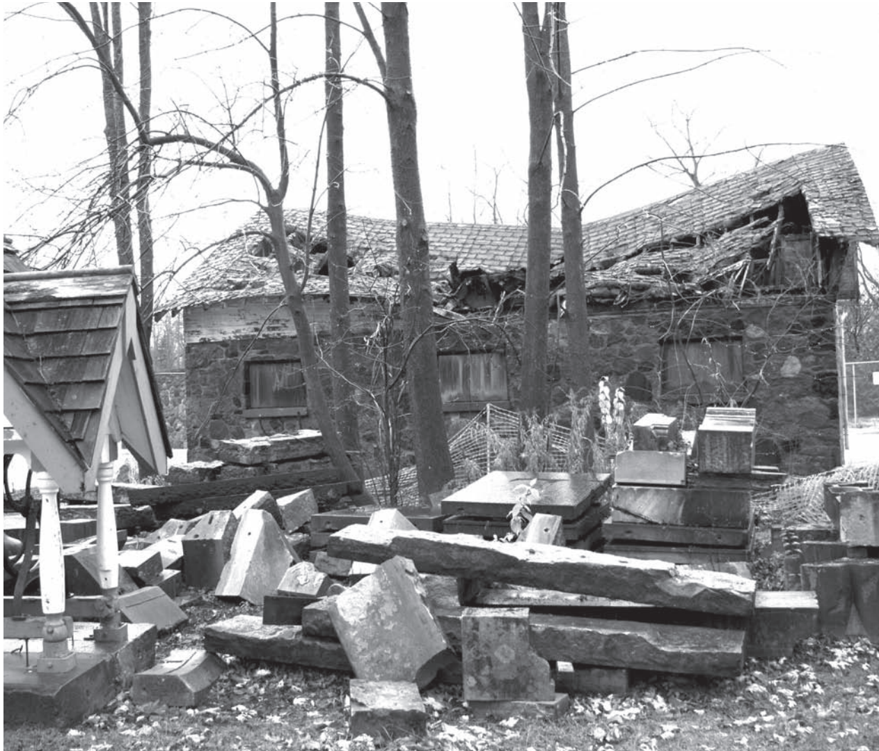
Aakanksha Tangri // Observer

The City of Toronto terminated a bid by Centennial College to redevelop Scarborough's historic Guild Inn. The college had originally proposed to build a hotel and later senior-friendly condominiums.