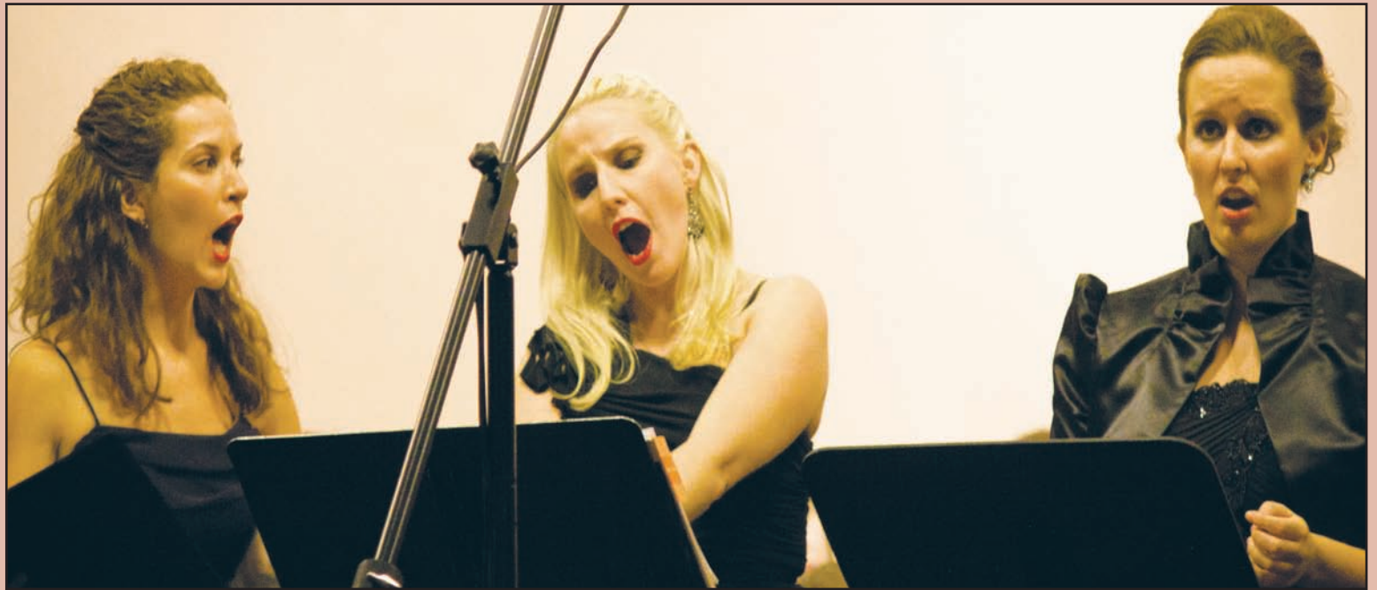
Alex Kozovski /// Observer

Musically, the performers were strong. The two choirs provided tremendous, lush chorus in the backdrop of the show, supporting the eight