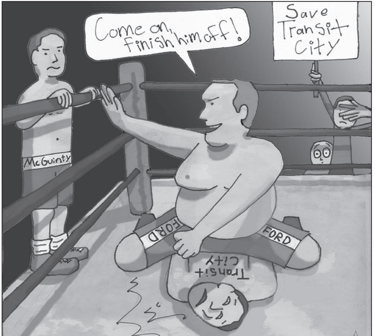
BRADLEY FEATHERSTONE/The Observer