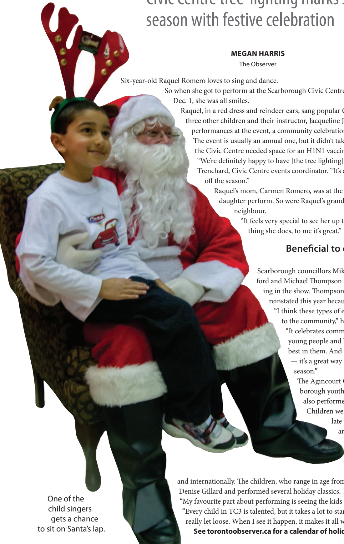
One of the child singers gets a chance to sit on Santa's lap.

See torontoobserver.ca for a calendar of holiday events in your area.