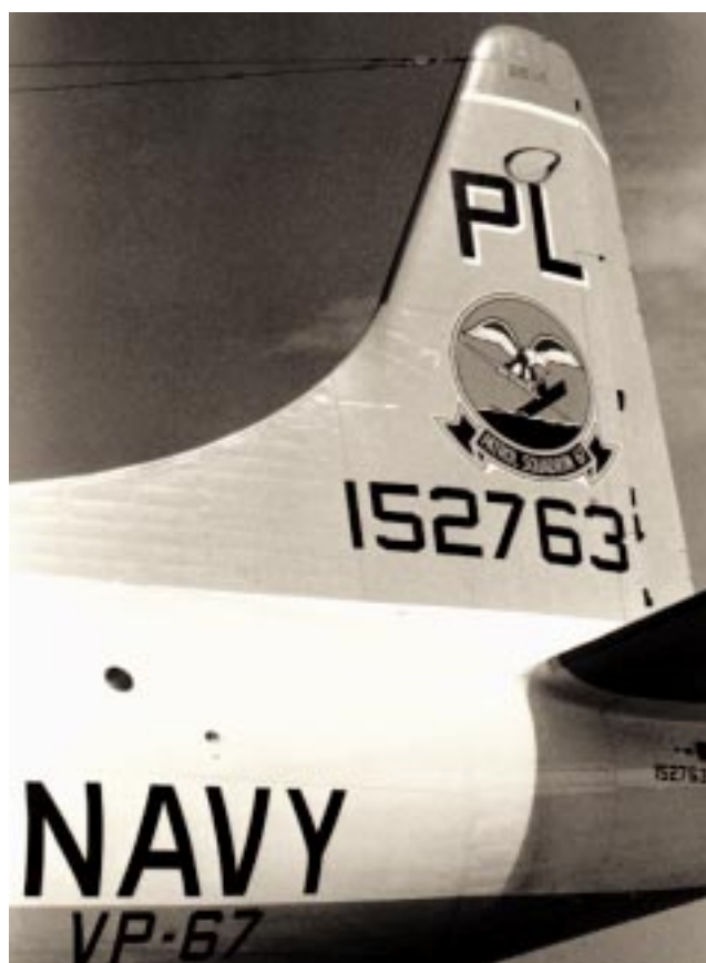
A close up of the tail of a squadron aircraft showing the full design of the squadron insignia.