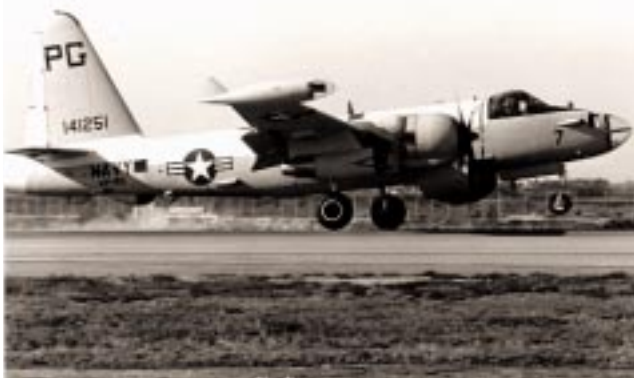
A squadron SP-2H landing at Point Mugu, January 1971.

1–13 Jun 1972: VP-65 and VP-67 participated in exercises Halcon Vista VII and Condeca Aguila III with the Nicaraguan military forces.