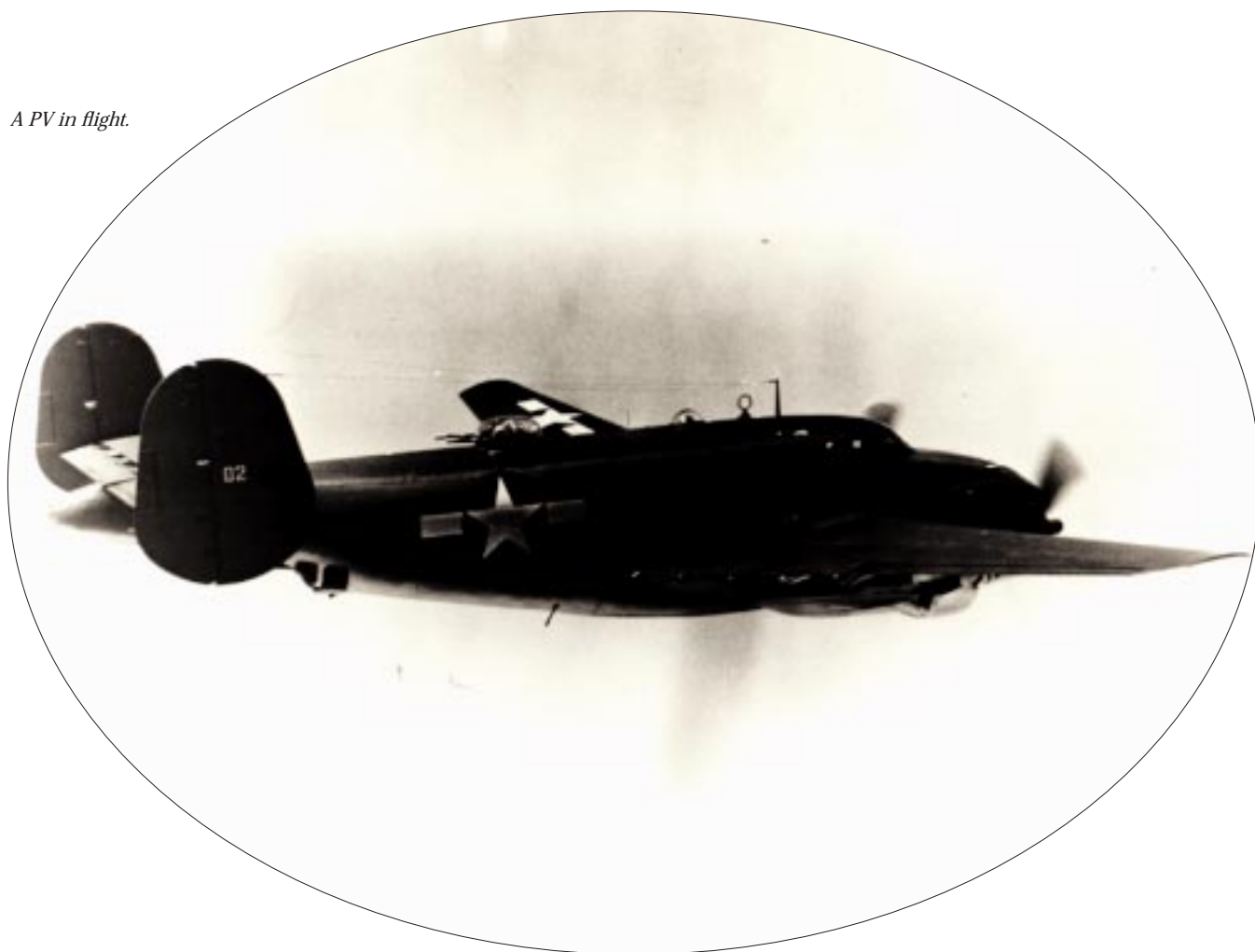
A PV in flight.