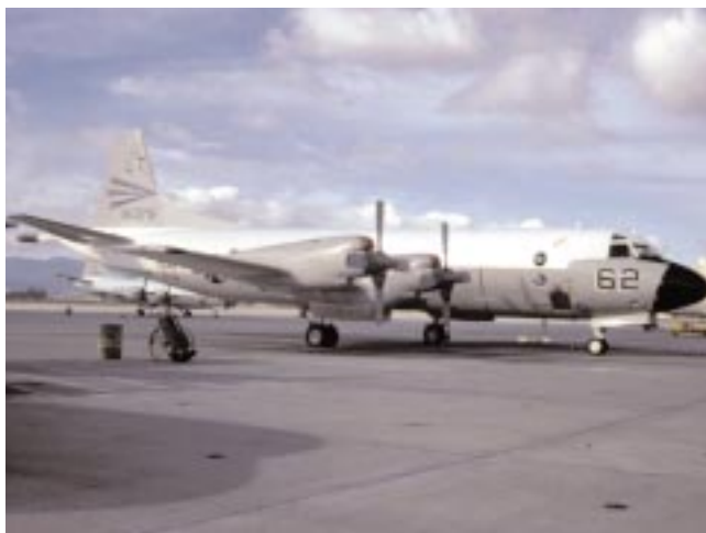
A VP-62 P-3A at NAS Moffett Field in April 1978.

Aug 1981: VP-62 deployed to NAS Bermuda. During the two-week period of squadron operations, a record of four hurricanes in a row hit Bermuda. Nonetheless, the squadron participated in exercises Ocean Safari and Ocean Venture with no mission aborts.