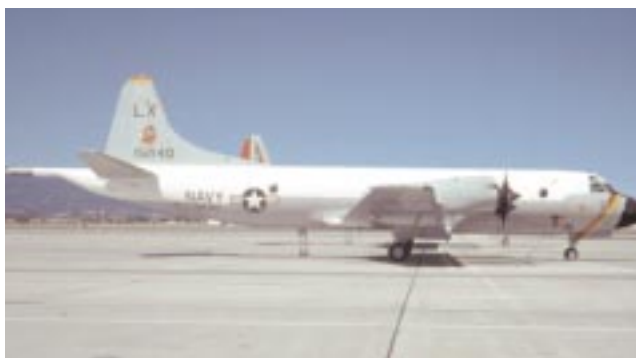
A VP-90 P-3A at NAS Moffett Field in June 1978 (Courtesy Rick R. Burgess Collection).

1 Nov 1970: VP-90 was established at NAS Glenview, Ill., as a Naval Air Reserve land-based patrol squadron flying 12 Lockheed SP-2H Neptunes. The new squadron came under the operational and administrative control of Commander, Naval Air Reserve Forces, Atlantic, and Commander, Fleet Air Reserve Wings, Atlantic. VP-90 was established as a result of a major reorganization of the Naval Air Reserve that took place in mid-1970. Under the Reserve Force Squadron concept 12 land-based naval reserve patrol squadrons were formed and structured along the lines of regular Navy squadrons with nearly identical organization and manning levels. The 12/2/1 concept had 12 VP squadrons under two commands, COMFAIRESWINGLANT and COMFAIRESWINGPAC. These two commands came under the control of one central authority, Commander Naval Air Reserve.