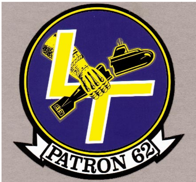
The squadron's only insignia.

The squadron's only authorized insignia was approved by CNO on 3 August 1971. In the circular design an armored fist was shown crushing an enemy