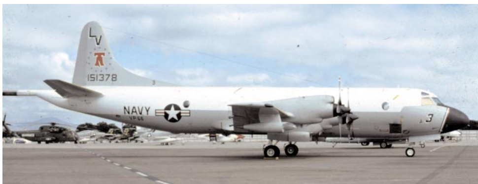
A VP-66 P-3A at NAS North Island in January 1979.