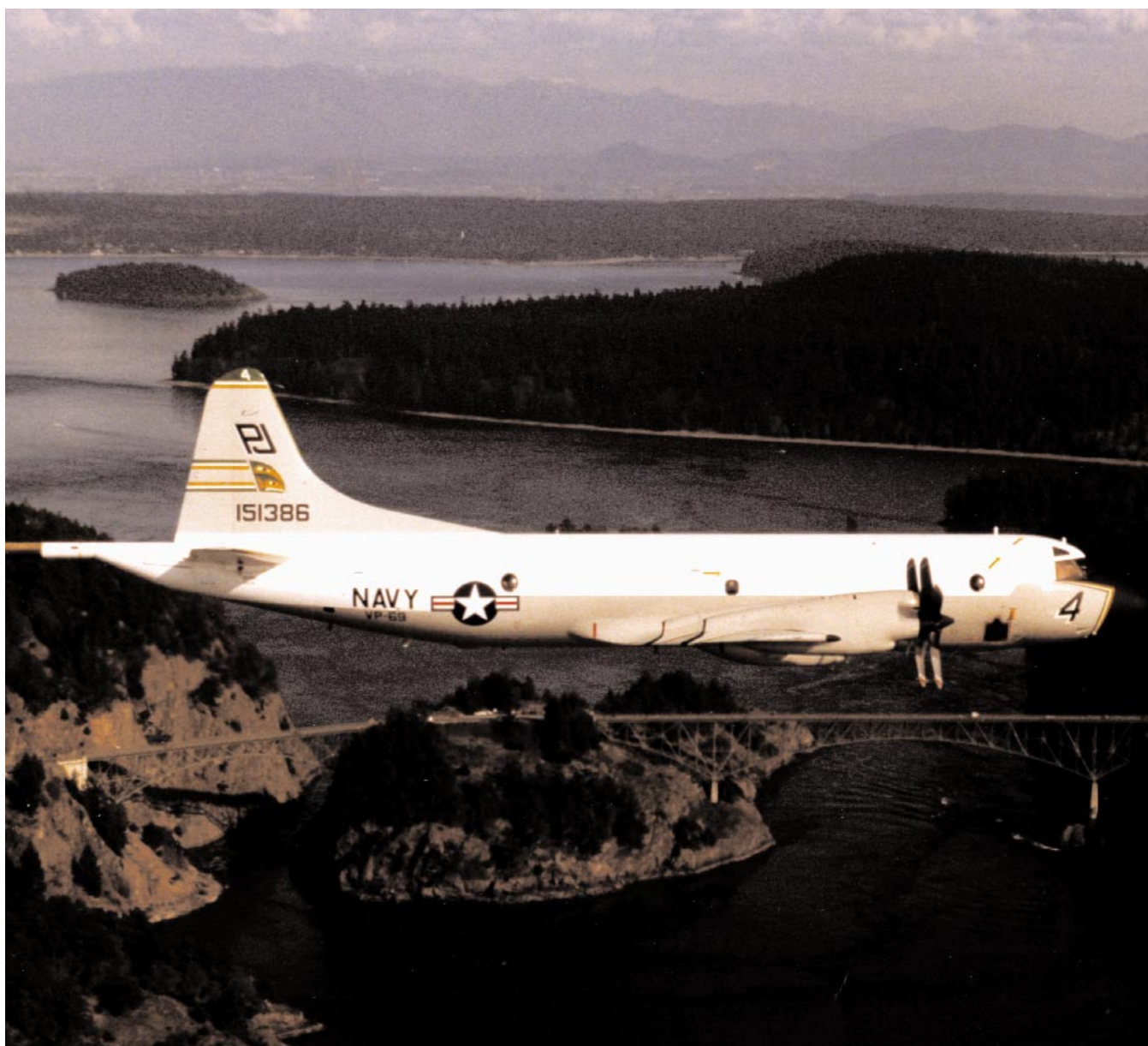
A squadron P-3A in flight, circa 1984.

Type of Aircraft Date Type First Received SP-2H Nov 1970 P-3A DIFAR Nov 1975 P-3A TAC/NAV MOD May 1986 P-3B TA/CNAV MOD Jan 1990 P-3C UI Oct 1992 P-3C UIII Jan 1995