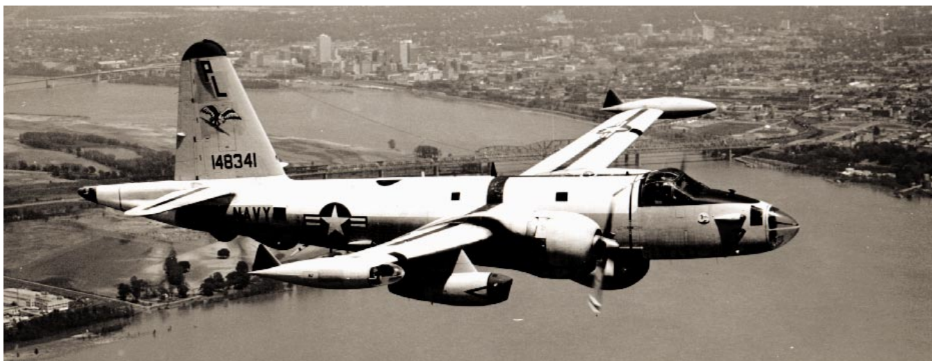
A squadron SP-2H in flight

Jul 1974: The Golden Hawks deployed to Naval Air Reserve Unit (NARU) Point Mugu, Calif., for two