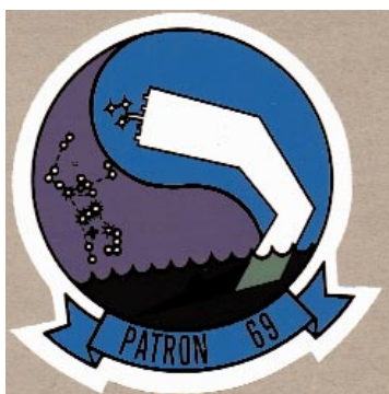
The squadron's Yin and Yang insignia.

The squadron's current insignia was approved by CNO on 8 July 1971. The complex, but rather original design is comprised of a circle divided into two curved halves like the Asian Yin and Yang.