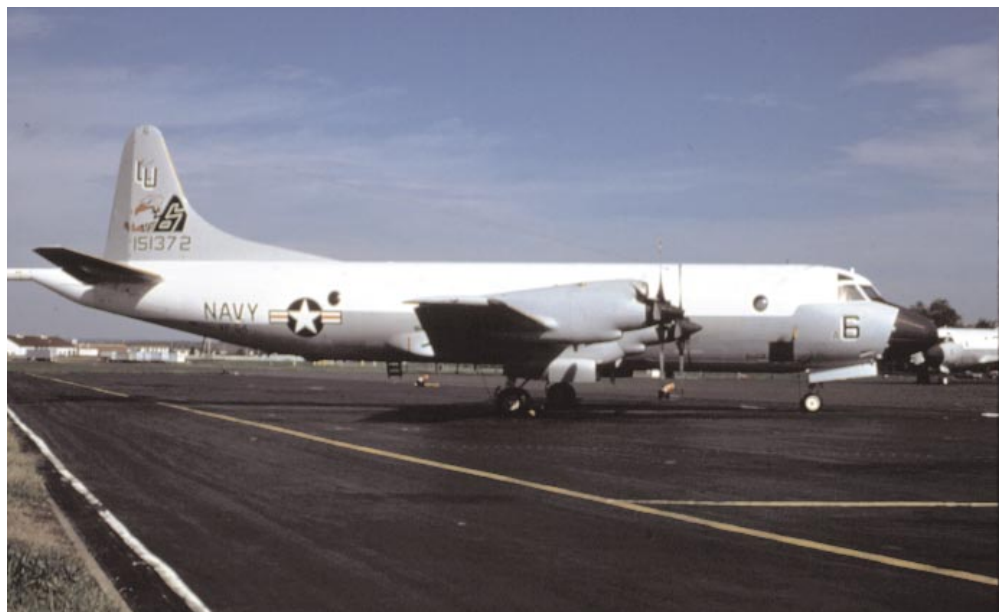
A VP-64 P-3A at NAS Glenview in October 1977.