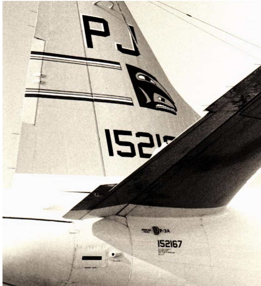
A close up of the tail of a squadron aircraft showing the tail code PJ and its insignia design relating to its nickname Totems.