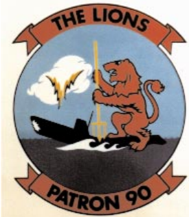
The squadron's third insignia.

The squadron's third insignia was in use less than six years. It was a more complex design featuring a rampant lion stabbing a trident into the broken hull of a submarine. Color: sky, light blue with white cloud; lightning from cloud, yellow; sea, dark blue; submarine, black with white hole in bow; breaking wave, white; lion, brown; trident, gold. A brown scroll at the top