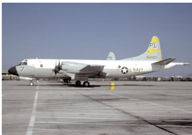
A VP-67 P-3A at NAS Moffett Field in April 1979.

16 Jul-15 Aug 1979: Upon completion of transition to the P-3A, VP-67 deployed for its ADT to NAS Whidbey Island, Wash.; NAS Moffett Field, Calif.; and NAS Barbers Point, Hawaii.