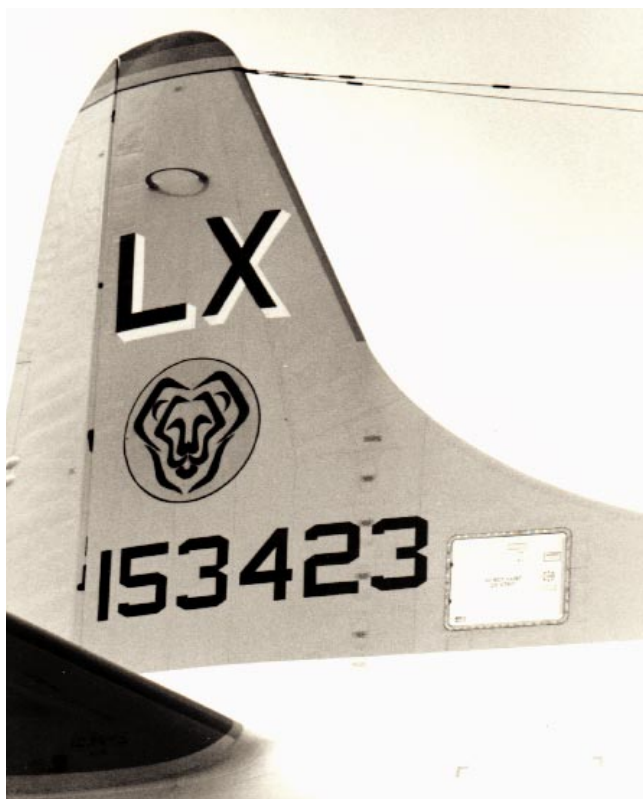
A close up of a squadron P-3 tail showing the second insignia design.