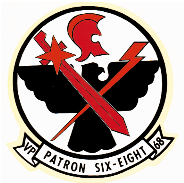
The squadron's only insignia.

The squadron's insignia was approved by CNO on 8 November 1972. The central theme of the design was