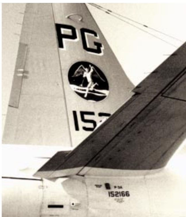
A close up of a P-3 tail showing the tail code PG and the squadron's first insignia.