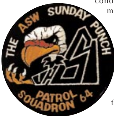
The squadron's second insignia was a modification of the first condor design.

The second squadron insignia was approved by CNO on 14 June 1976, and retained the condor theme but in a much modified form.