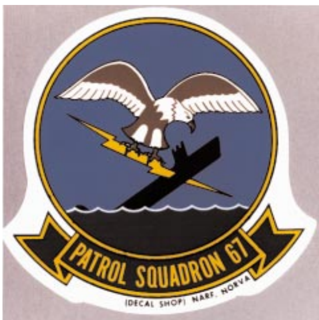
The squadron's one and only insignia.

The squadron's first and only insignia was approved by CNO on 15 October 1971. The design featured a hawk descending on a surfaced submarine. A lightning bolt held in the hawk's claws speared the subma-