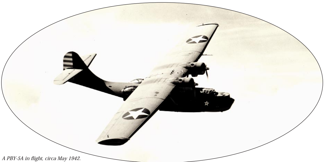
A PBY-5A in flight, circa May 1942.