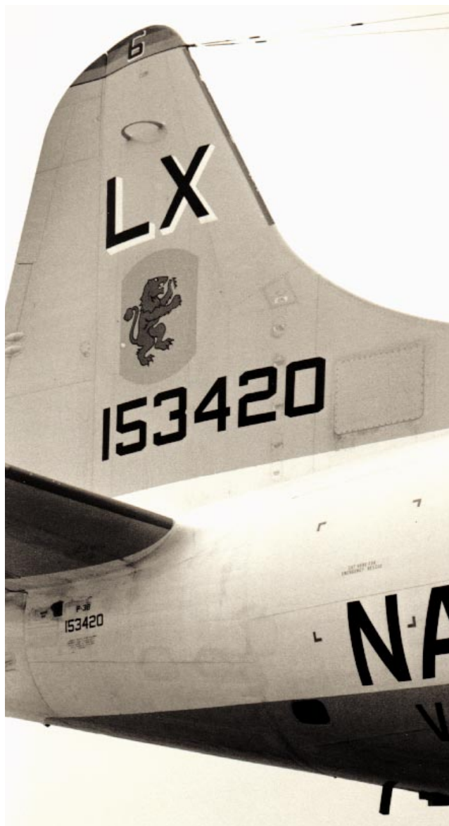
A close up of a squadron P-3 tail showing the third insignia design.