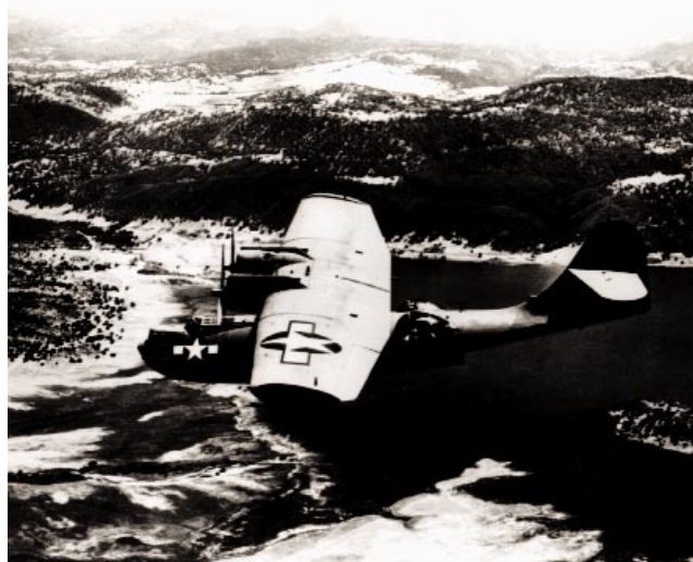
A PBV in flight.

16 Aug–16 Sep 1943: A detachment of VD-2 deployed to the Canadian Arctic to conduct mapping and aerial surveys. Three squadron aircrews of six officer pilots and 16 enlisted personnel were assigned to conduct photographic mapping of Frobisher Bay, Koksoak River and Ungava Bay. Aircraft used in the task were a PBV-5A Catalina, PV-1 Ventura and a SNB-1 Model 18 Kansan variant. The detachment returned to NAS Norfolk on 16 September 1943.