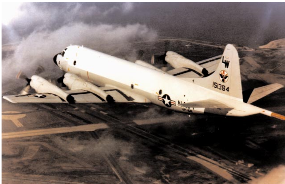
A squadron P-3A in flight.