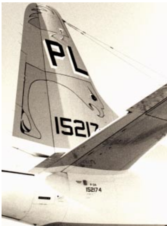
A close up of the tail of a squadron aircraft showing the tail code PL and the outline of a hawk.