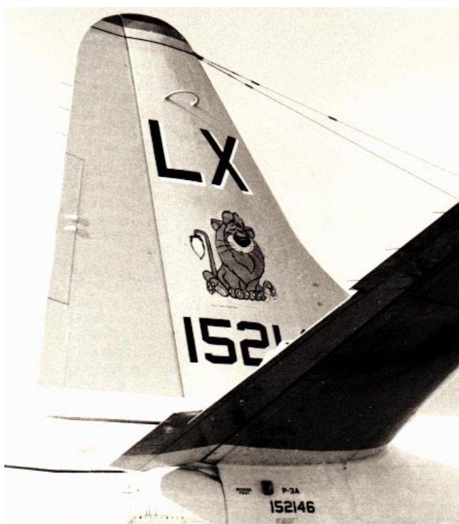
A close up of a squadron P-3 tail showing the fourth and last insignia design.