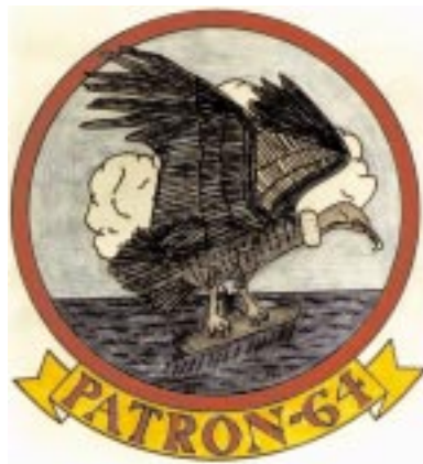
The squadron's first insignia.

The first squadron insignia was approved by CNO on 8 September 1971. The central feature of the design