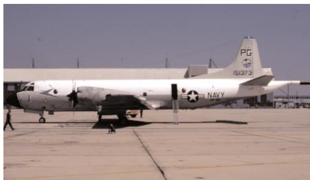
A VP-65 P-3A at NAF Washington in April 1982.