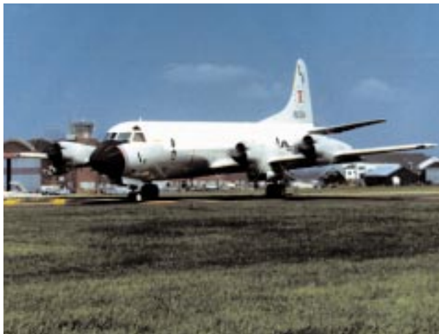
A squadron P-3A at NAS Willow Grove.