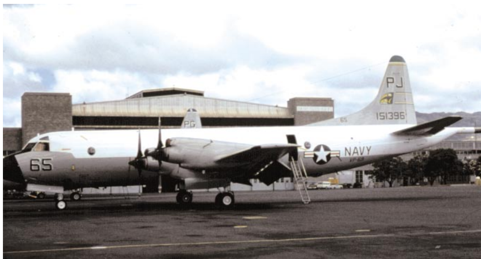
A VP-69 P-3A at NAS Barbers Point in June 1977.

14 Aug–12 Sep 1976: Annual ADT was conducted at NAS Barbers Point, Hawaii. Both consecutive two-week periods were devoted to transition training on