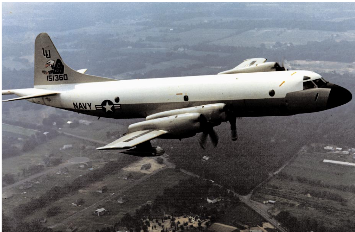
A squadron P-3A in flight.