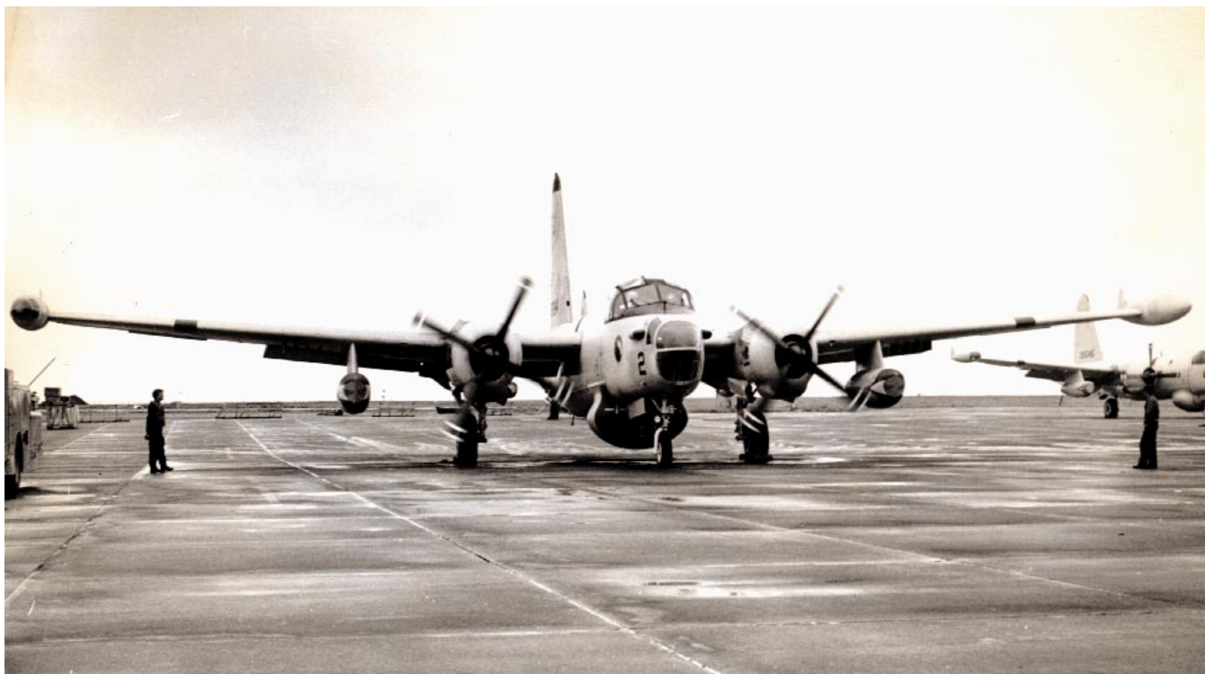
A squadron SP-2H at NAS Whidbey Island.

1 Nov 1970: VP-69 was established at NAS Whidbey Island, Wash., as a Naval Air Reserve land-based patrol squadron flying 12 Lockheed SP-2H Neptune aircraft. The new squadron came under the operational and administrative control of Commander, Naval Air Reserve Forces, Pacific, and Commander, Fleet Air Reserve Wings, Pacific. VP-69 was established as a result of a major reorganization of Naval Air Reserve that took place in mid-1970. Under the Reserve Force Squadron concept 12 land-based naval reserve patrol squadrons were formed and structured along the lines of regular Navy squadrons with nearly identical organization and manning levels. The 12/2/1 concept had 12 VP squadrons under two commands, COMFAIRESWINGLANT and COMFAIRESWINGPAC. These two commands came under the control of one central authority, Commander Naval Air Reserve. Personnel and equipment from the disestablished VP-60T1 at NAS Whidbey Island were utilized to form VP-69.