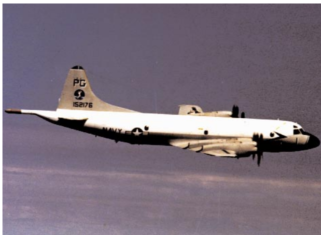
A squadron P-3A in flight, August 1980.

Nov 1986: VP-65 received a letter of commendation from the Secretary of the Navy for the squadron's role in Operation Close, a coordinated operation with the Coast Guard in support of their drug interdiction efforts.