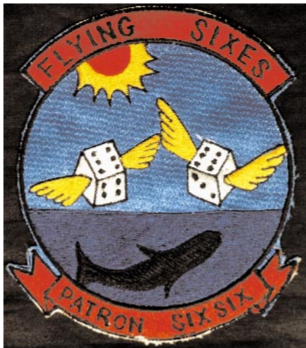
The squadron's first insignia.

The first insignia used by VP-66 was approved by CNO on 6 May 1971. The squadron designation was