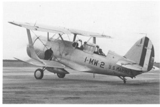
In 1940, the 1st MAW HQ aircraft was this Curtiss SBC-4.

An important step toward organized expansion was taken on March 1, 1942. Squadrons were broken into as even a