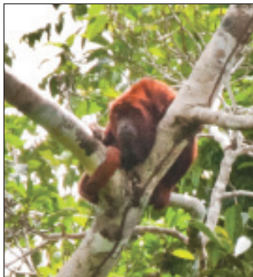
Observer, Aneta Tasheva

OBSERVE THE ANIMALS: (Clockwise from top) After biologists on the boat have finished recording data about a common caiman, Teddy Yuyarima holds the alligator-like reptile just before untying and releasing it back into the Samiria River. Children in the small town of Nauta, located in the northeastern part of the Peruvian Amazon, pose with a puppy that roamed the roads. A male howler monkey keeps a close watch on conservation biologists who travel through the rainforest to record their observations of the wildlife. A grey river dolphin briefly surfaces for air, exposing its dorsal fin, while fishing in the Pacaya-Samiria National Reserve.