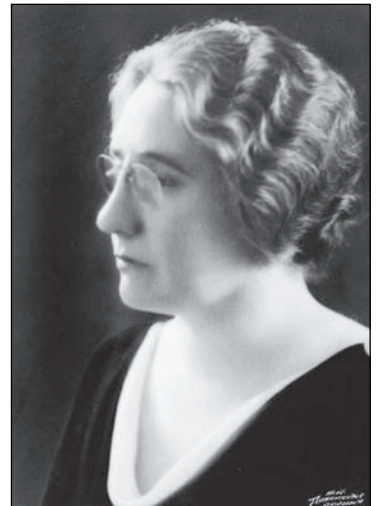
AGNES MACPHAIL 'Favourite daughter'