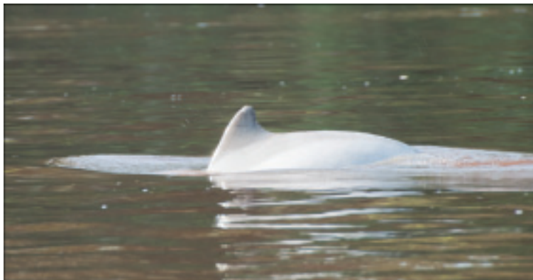
Observer, Aneta Tasheva