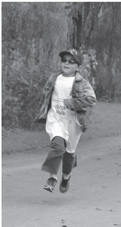
Alissa Heidman // Observer

Next year's goal will not only be raising more money, but spreading more awareness and gaining supporters to continue to provide stutterers with the invaluable work of speech therapy.