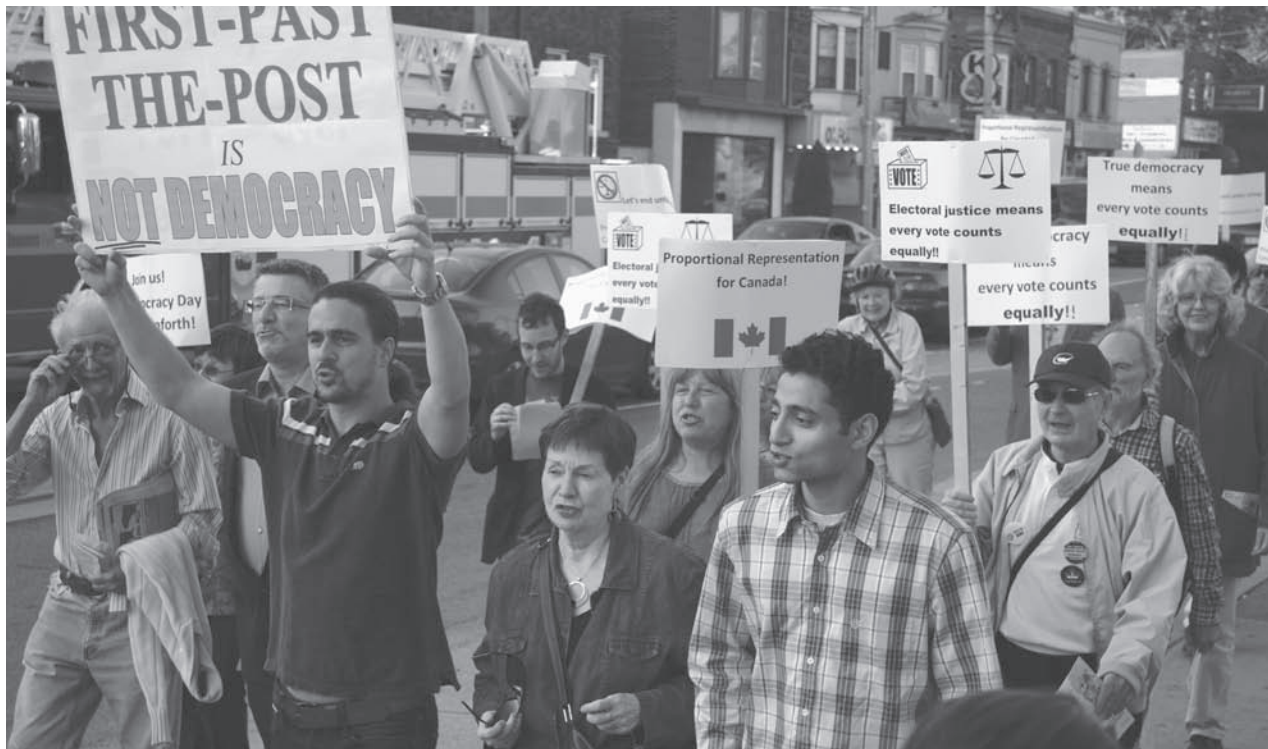
Sun Lingmeng /// Observer

Toronto-Danforth MP Craig Scott and local electoral reformers marched before their Sept. 19 meeting at Eastminster United Church on Danforth Avenue.