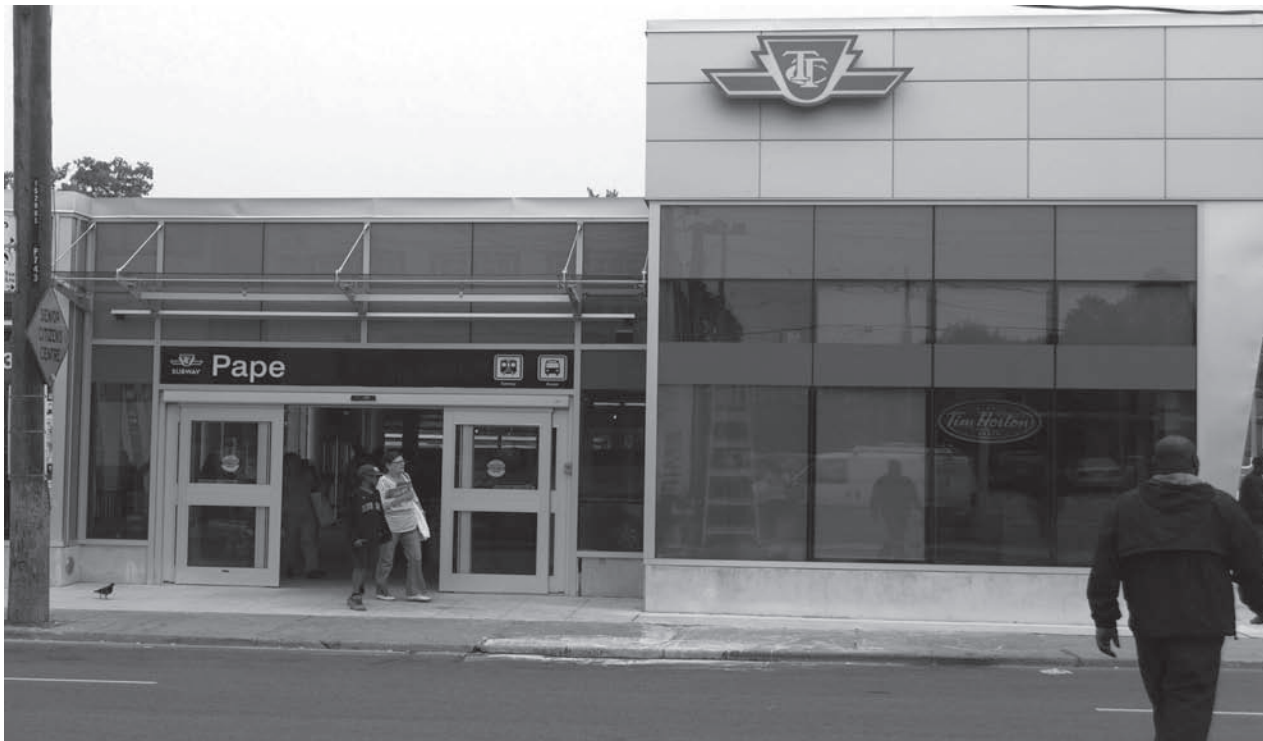
Amirul Islam // Observer

A $37-million modernization project, which started in 2009, has changed the face of the Pape subway station.