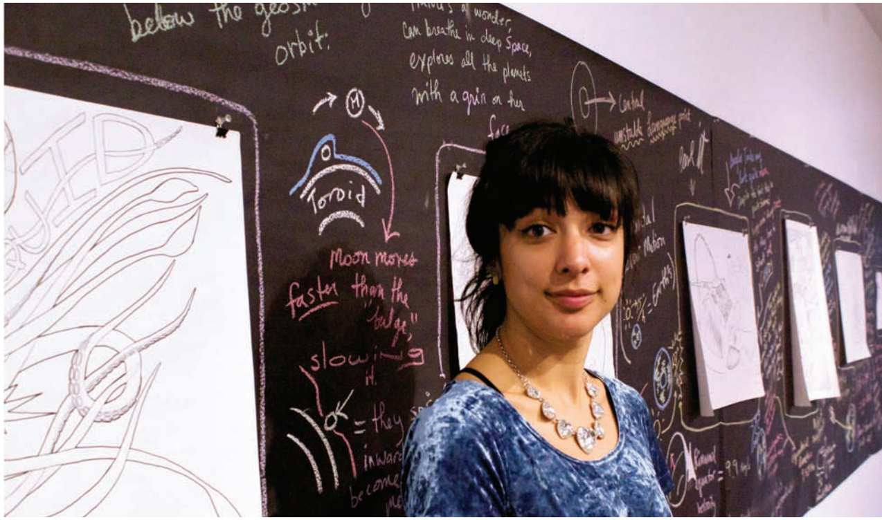
Catherine Magpile /// The Observer