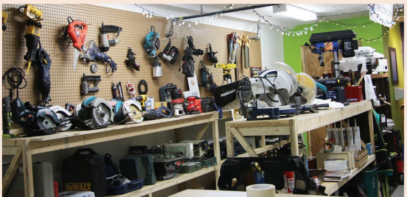
Sun Lingmeng /// Observer

The new Toronto Tool Library and Makerspace offers everything from drills to 24-hour access to the wood-working shop. Library membership is $50 a year, while it costs $100 a month to use the makerspace.