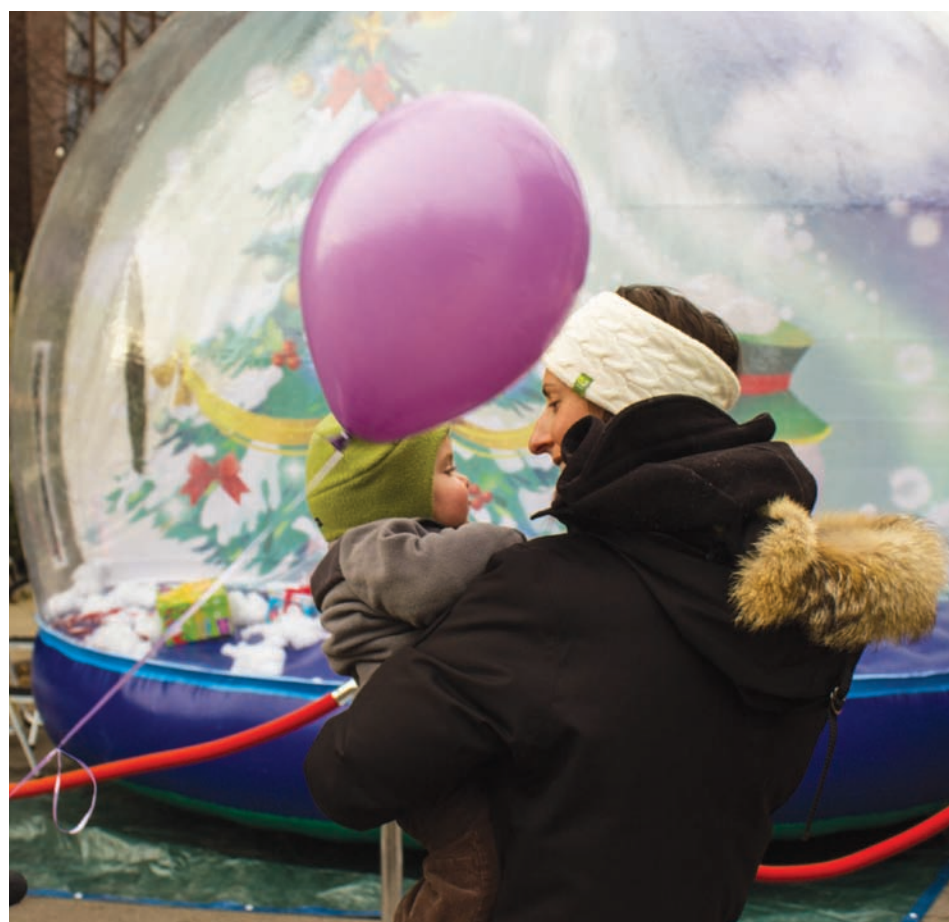
Linda Cotrina /// Observer

"It used to be that someone would come up with one headlight, or no seatbelt," Cox said. "But the RIDE program wasn't meant for that. I would only caution them. Our main purpose is to check for anyone drinking and driving."